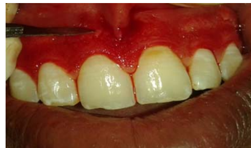
Fig 2: Depigmentation with Scalpel