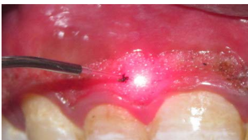
Fig 11: Depigmentation with Laser