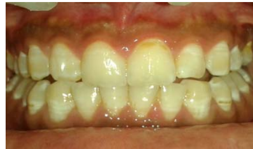
Fig 1: Pre-operative