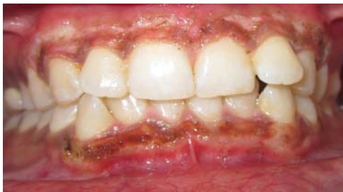
Fig 8: Depigmentation with Electrosurgical Unit