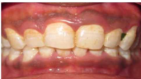
Fig 10: Pre-operative