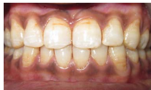
Fig 4: Pre-operative