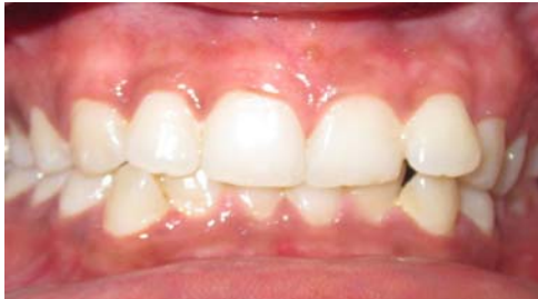
Fig 9: Post operative After 3 Months