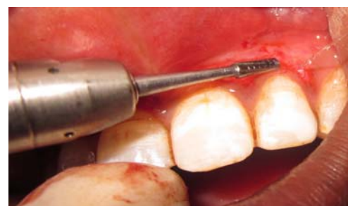
Fig 5: Depigmentation with Bur