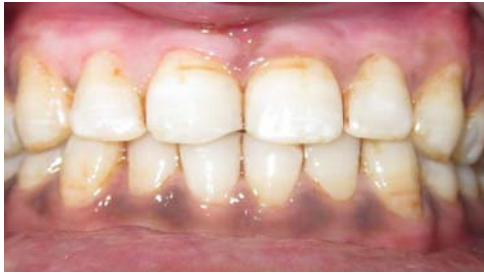
Fig 6: Post-operative After 3 Months