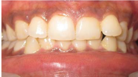
Fig 7: Pre-operative