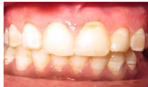
Fig 3: Post-operative After 3 Months