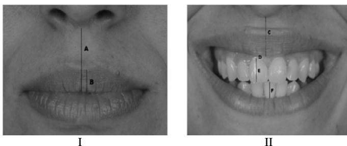
Fig 1: vertical measurements:

Some pitfalls of this study were related to the selection criteria of the patient sample. Standard age and sex groups should be determined to eliminate any age-related soft-tissue changes, and previous plastic or aesthetic interventions should also exclude patients from the study. Also the smile has been quantified only in the vertical dimension. The smile in the horizontal dimension should also be quantified.