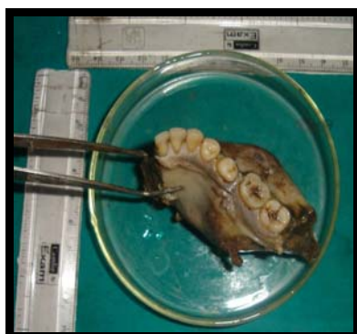
Fig 3: Gross specimen showing segmental resection of mandible

On gross examination the resected mandibular specimen was approximately measuring around 8 cmx4cmx3cm in dimension which was extending from mesial of 41 to distal surface of 47. Bony swelling was seen in the premolar to molar region, the swelling was hard in consistency with buccal and lingual cortical plate expansion (Fig-3).