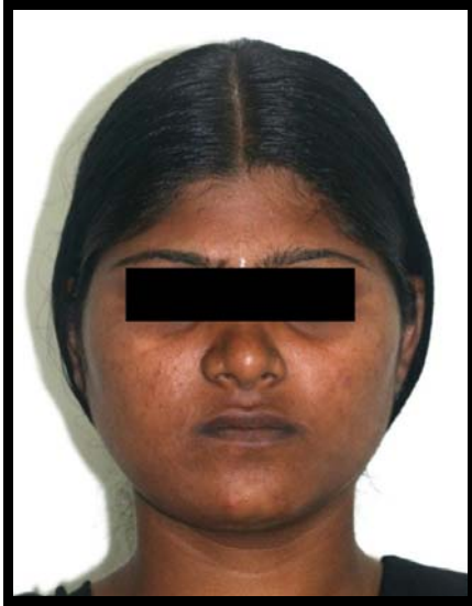
Fig 1: Extra- Oral Photograph

Intraorally vestibular obliteration was seen. Panoramic view was showing ill-defined radio-opacity showing a ground glass appearance involving lower border of the mandible extending upto alveolar ridge causing displacement of 2 nd premolar (Fig-2).