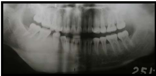
Fig 2: Panoramic radiograph showing Ground glass appearance on right side of mandible

Intraorally vestibular obliteration was seen. Panoramic view was showing ill-defined radio-opacity showing a ground glass appearance involving lower border of the mandible extending upto alveolar ridge causing displacement of 2 nd premolar (Fig-2).