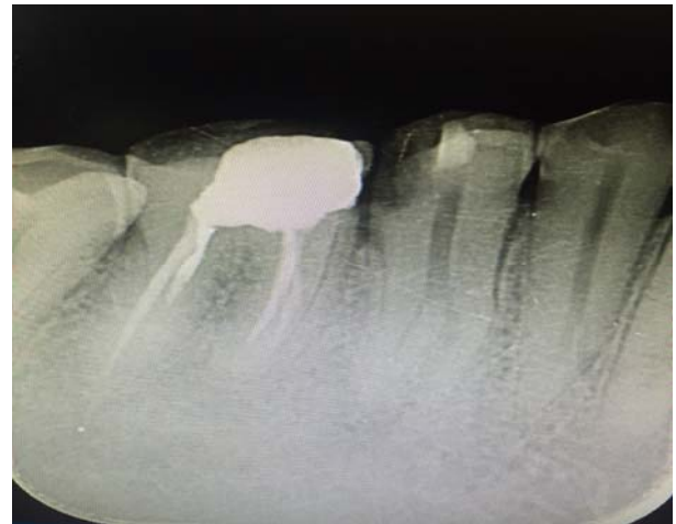
Fig 1: Pre-operative radiographic picture showing mid root bifurcation of the root with two separate canals

The suspicion of the presence of a missed canal has to be considered if the patient reports with the pain and sensitivity in the endodontically treated mandibular premolar [27] .