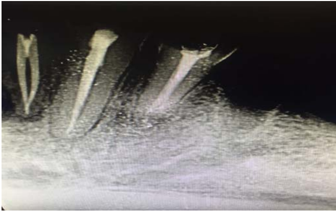
Fig 3: Post obturation radiographic picture