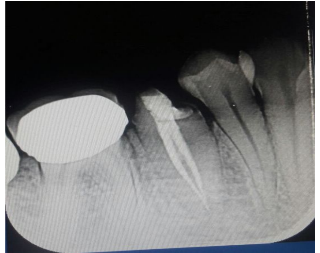
Fig 7: Post obturation radiographic picture