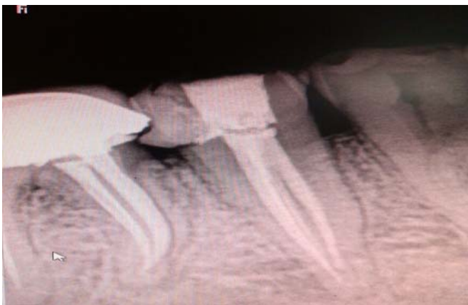
Fig 5: Post obturation radiographic picture