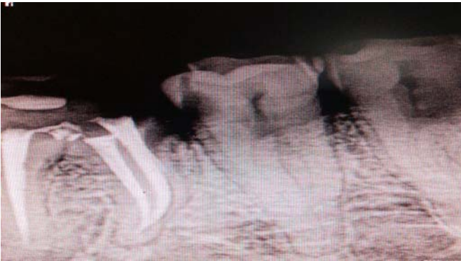
Fig 4: Pre-operative radiographic picture showing three root canals