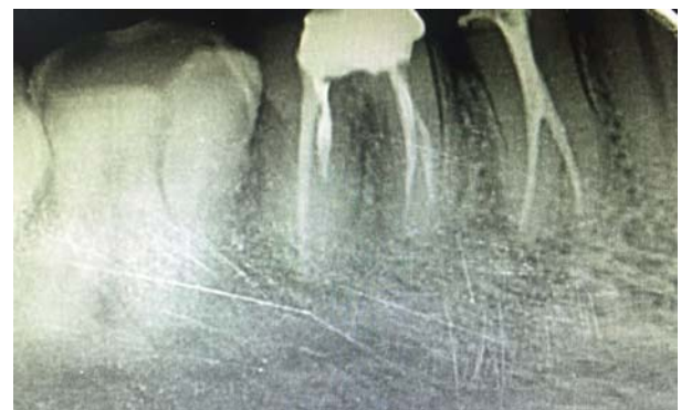
Fig 2: Post obturation radiographic picture