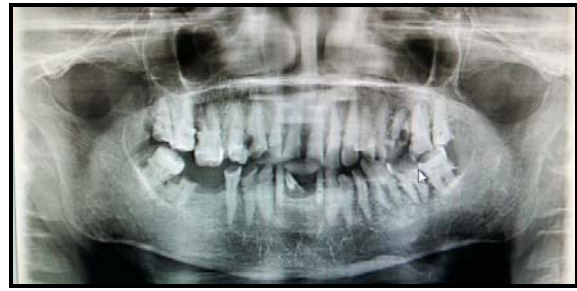
Fig 4: OPG