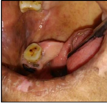
Fig 2: A bony hard swelling

Patient was apparently normal before 10 years and then she developed a swelling on the same jaw region, which is of gradual onset which slowly increases in size to attain the present size.