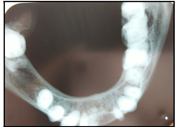
Fig 5: Occlusal radiograph