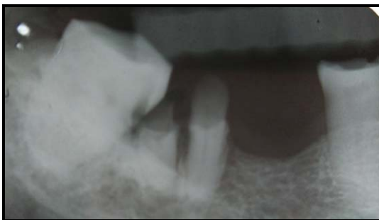
Fig 3: IOPA

An intraoral radiograph and panoramic radiograph revealed no abnormalities. [Figure 3, 4]