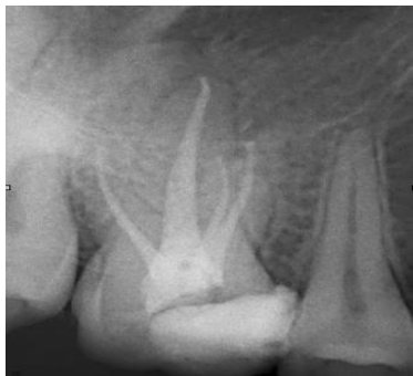
Fig 3: postoperative radiograph