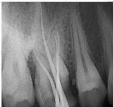
Fig 2: Master cone radiograph showing two mesiobuccal canals