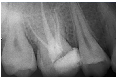
Fig 4: Follow up at 6 months