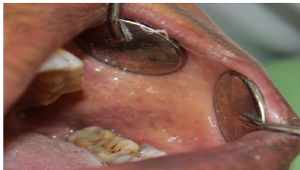
Fig 3: Complete resolution of lesion after 1 month follow up after restoration with composite irt 36 & 38