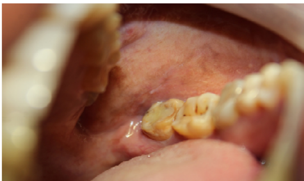
Fig 4: 6-month follow-up, no lesion was seen and no discomfort to patient