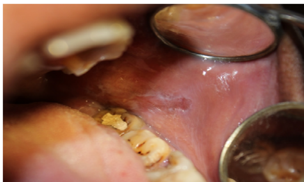
Fig 2: 15 days after temporising 36 & 38 with Zinc Oxide Eugenol, all the major signs and symptoms subsided