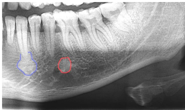
Fig 3: type III