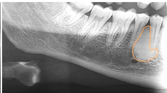
Fig 2: type II