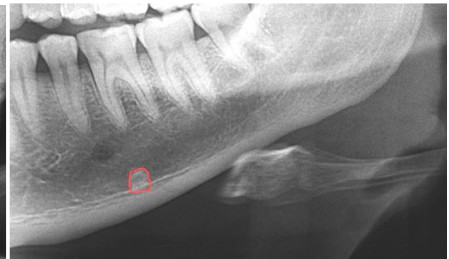
Fig 4: type IV

For assessment of the study sample all the digital radiographs were viewed on the same LCD (liquid crystal display) monitor. Two well-trained examiners observed the radiographs without the knowledge of age and gender of study group. Chi-square test was performed to evaluate the difference in the prevalence of DBIs between gender groups and radiographic appearance of DBIs. All statistical analyses were performed by using the SPSS 17.0 (SPSS Inc., Chicago, IL, USA) for Windows. Reproducibility to test intra- and inter-examiner reliabilities, two different examiners staged the prevalence of DBIs on 100 randomly selected radiographs. Each examiner repeated the process after 1 month (intra-examiner), and Cohen's kappa test was performed to calculate the intra- and inter-examiner agreements.