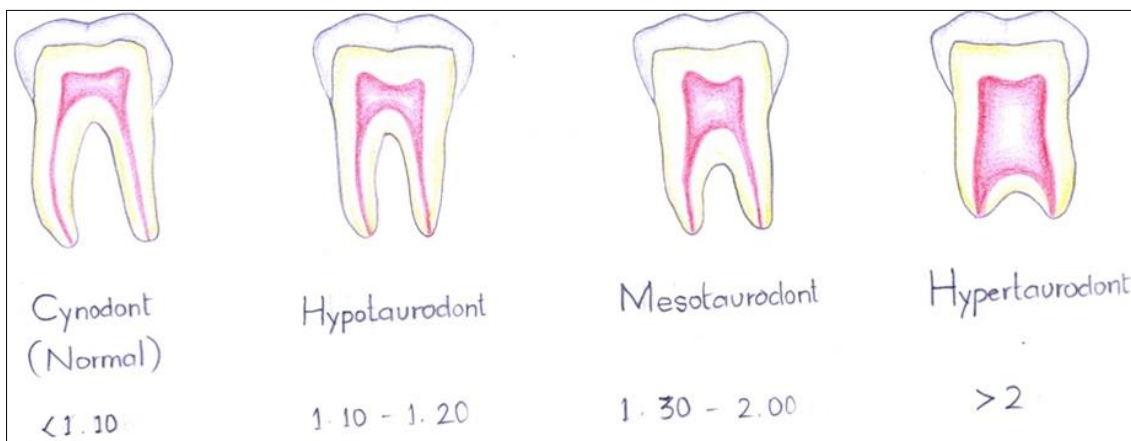
Fig 4: Diagrammatic representation of normal (cynodontic) tooth and three subtypes of taurodontic teeth as proposed by Shaw (1928).