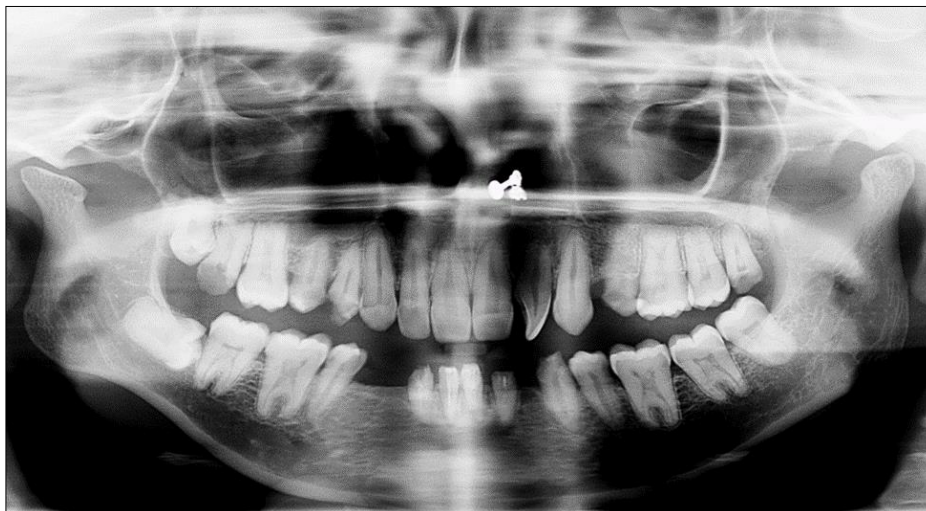
Fig 1: OPG showing multiple taurodont teeth

Taurodont teeth may, in specific cases, offer favorable prognosis. Where periodontal pocketing or gingival recession occurs, the chances of furcation involvement are considerably less than those in normal teeth because taurodont teeth have to demonstrate significant periodontal destruction before furcation involvement occurs [10].