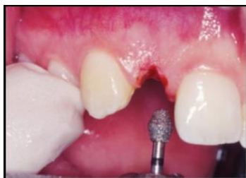
Fig 3: A coarse diamond sculpts the soft tissue drape of the implant crown

When the soft tissue along the edentulous crest is at the level of the desired interdental papillae and is of sufficient quality and volume, a subtraction technique (e.g., gingivoplasty with a coarse diamond) sculpts the crestal gingival tissues to reproduce the cervical emergence contour of the crown, complete with interdental papillae and proper labial gingival contour. (Fig. 3) [2]