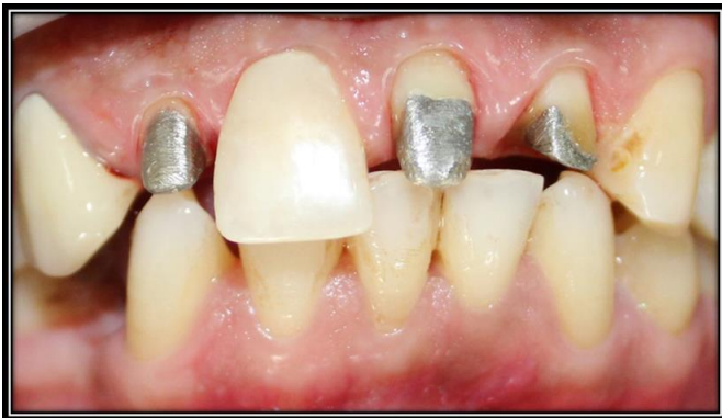
Fig 8: Cast Posts Cemented Following Endodontic therapy