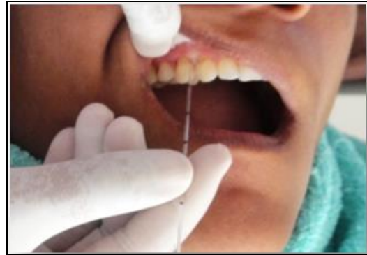
Fig 1: Collection of GCF from periodontal pocket site for ALP estimation

a 5 micron micropipette from the gingival sulcus of the teeth to be treated (Figure 1). This was repeated on 7 th day and 14 th day. The samples were stored in sterile vials containing 2 ml tris carbonate buffer in a freezer at 4 degree C and sent for estimation of alkaline phosphatase level. Pre-surgical clinical measurement made was horizontal Probing depth at the furcation using 2N Naber's probe. Conventional intraoral periapical radiographs with a X ray mesh gauge were taken at baseline and repeated at 6 months by the study examiner 1 and area of bone fill was assessed using a computer aided software. †