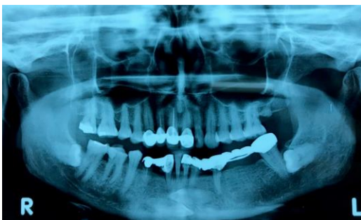
Fig 2: OPG showing Kissing Canine