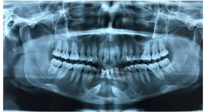
Fig 3: OPG showing lesion with Canine