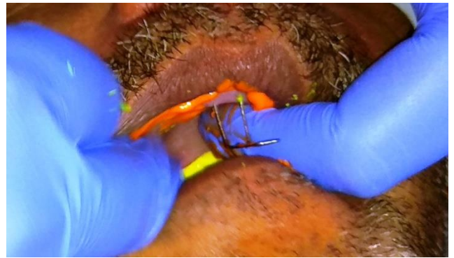
Fig 5: holding the tray till the material sets