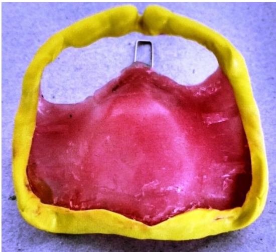
Fig 1: Completed border moulding on a special tray with window corresponding the flabby tissue.