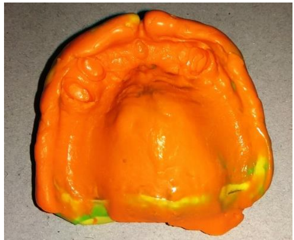
Fig 6: completed impression