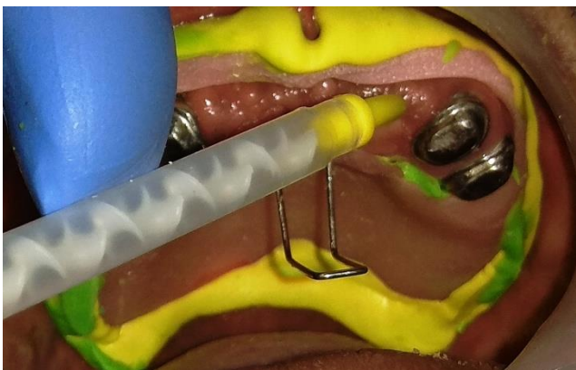
Fig 3: Injecting the light body impression material