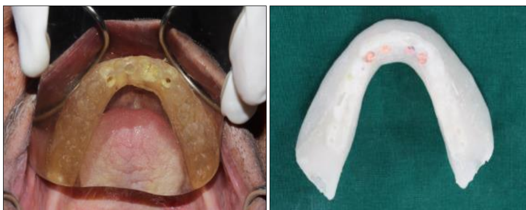
Fig 2: Radiographic and Surgical Guide.

positions following standard protocol. After 48 hours, tissue surface of mandibular denture was relieved and relined using temporary soft denture liner.