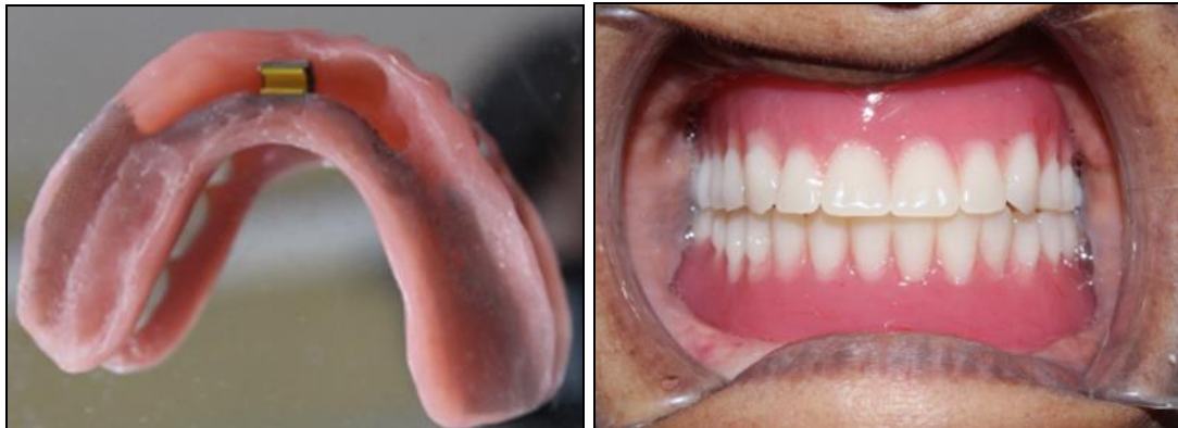
Fig 4: Final Mandibular Denture and Intra Oral View of Final Dentures

with composite resin and the denture was inserted into the patients mouth and checked for proper occlusal contacts and extensions (Fig.4). The patient was called back for follow up recall visits to evaluate the final denture (Fig. 4). A final OPG was taken to evaluate for implant osseointegration and proper seating of the bar framework (Fig.5).