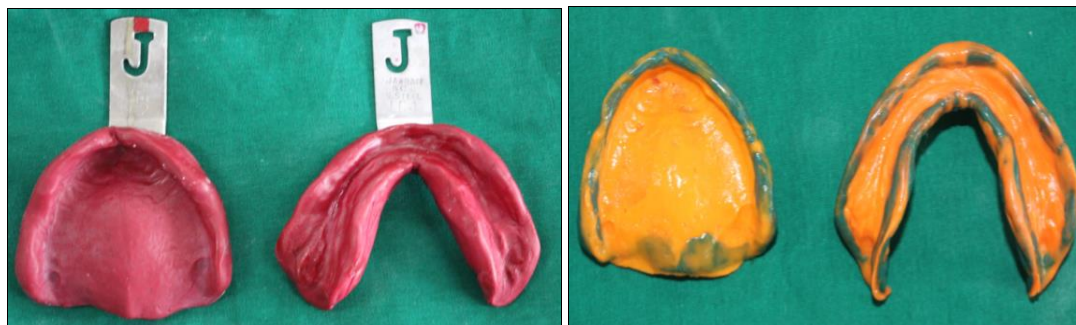
Fig 1: Maxillary and Mandibular Primary and Final Impressions.

favourable implant positions and the patient was asked to take a CBCT wearing the same which acted as a radiographic guide (Fig. 2). With the help of this CBCT and digital imaging software the implant treatment planning was done and the implant locations, size and diameter were determined.