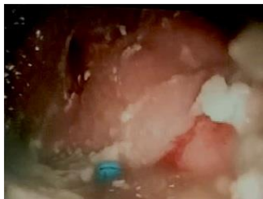
Fig 2: The stomach

As the endodontic instrument has a sharp edge which is piercing the mucosa, an emergency endoscopy procedure was advised under general anesthesia. Endoscopy revealed that the endodontic instrument had pierced the mucosal folds tangentially, and was embedded in the left wall of fundus of the stomach (Figure 2).