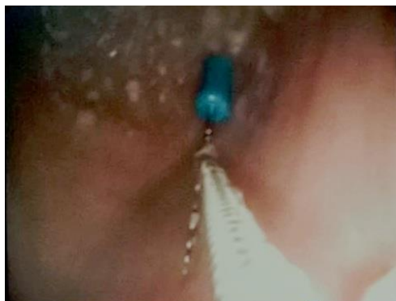
Fig 3: The mucosal fold

Using an endoscopic grasper, the handle of the endodontic instrument was grasped, gently pulling it out of the mucosal fold. (Figure 3)