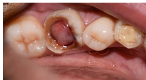
Fig 1: Preoperative clinical photograph

Endocrowns are minimally invasive preparations that preserves the biomechanical integrity of nonvital posterior teeth and can be considered as reliable alternative to post cores and full crowns. It is a promising treatment option for teeth presenting restorative difficulties due to minimal crown height but having sufficient tissue available for stable and durable adhesive cementation.