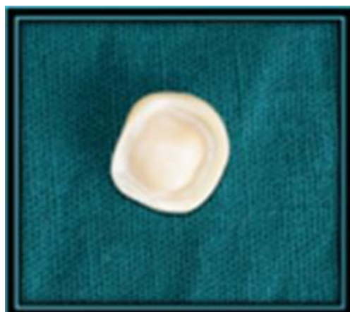
Fig 6: Fabricated all ceramic endocrown