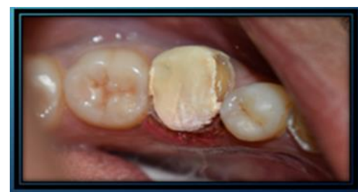
Fig 4: Endocrown preparation