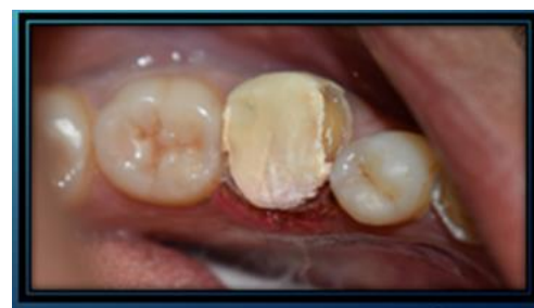
Fig 3: After laser crown lengthening