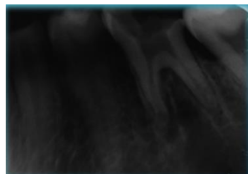
Fig 2: Preoperative radiograph