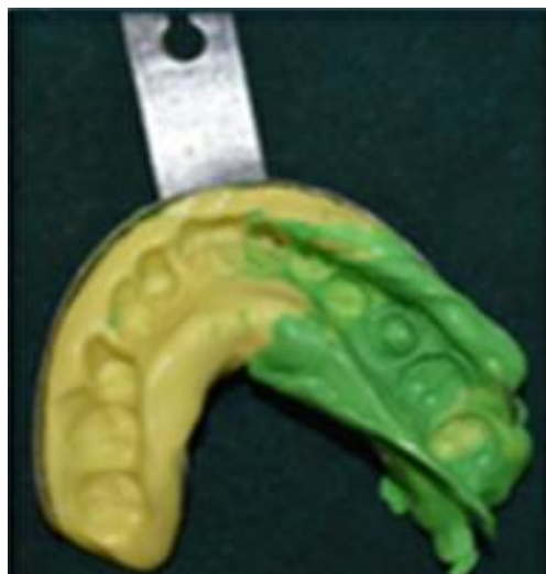
Fig 5: Impression