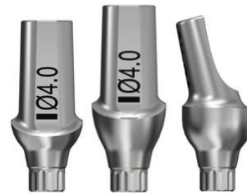
Fig 11: Press Fit Abutment

Stryker & Miter blades, supplies this abutment. Straight and angled variants are available with an angle of 15 degrees. To insert, the head is oriented correctly and tapped firmly with a mallet. It is impossible to remove it after tapping [23].