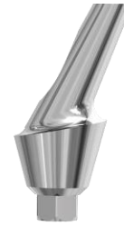
Fig 3: Angulated Abutment

These incorporate a thirty degree or seventeen degree angulation in their design. They are used to overcome problems associated with implant angulation. The base contains a twelve-sided configuration. They are indicated for multiple implant restorations [11].