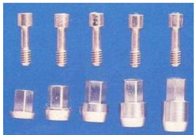
Fig 4: Ceraone Abutment

Various collar heights ranging between 1 mm and 5 mm are available. They have a hexagonal base and are connected to the implant by a gold alloy abutment screw with 32 Ncm of force. Plastic impression copings fit by frictional resistance to the abutment and are retrieved with the impression. The analog is placed and the cast poured. Healing caps are placed to maintain soft tissue support. Porcelain is applied to ceramic caps to fabricate all-ceramic single tooth restorations. Temporary or permanent cementation is performed. It is critical to remove excess cement [13].