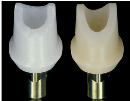
Fig 9: Ceramic Abutment

5. Ceramic abutments: They are made of dense porcelain. And enjoy a good success rate. They are highly aesthetic. The final crown should be fabricated in all-ceramic & cemented with a tooth colored luting agent. They are not suitable where significant angulation changes are needed [19].