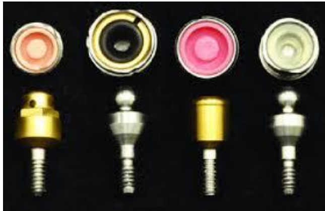
Fig 5: Overdenture Abutments

incorporating the attachments in the clinical or in the laboratory. It is simple and time saving.