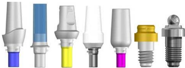
Fig 1: Abutment Connections

The various forms of abutments are: standard abutment, estheticone abutment, angulated abutment, ceraone abutment and overdenture abutment.