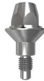
Fig 10: Threaded Abutment

c. Custom abutments (angled & straight): They are made by making impressions or by direct resin patterns. Impressions of internal threading of implants are made with a special transfer post. Impressions are removed, analog attached and cast poured. Angulations, those greater than 25 degree cause excessive force [22].