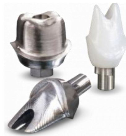
Fig 7: Custom Abutment

3. Fully customized abutments: These are useful in cases of compromised implant positioning. The implant head impression is made and the abutment placed in position on the model. The abutment shape is waxed onto the pattern and then cast 9 in precious metal. It is possible to move the long axis of final restoration [17] .