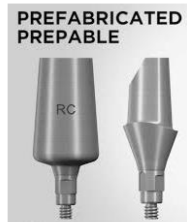
Fig 6: Prefabricated Abutments

This method offers a more predictable result although the impression is difficult to make. It is useful if the emergence and the profile of the soft tissue needs to be modified. This technique suits every situation, copes with angulation changes and allows soft tissue remodelling and a good emergence profile. The disadvantages of this technique is that it requires a more complex laboratory technique, second intraoral impressions and offers a less predictable fit of abutment to the crown [16] .