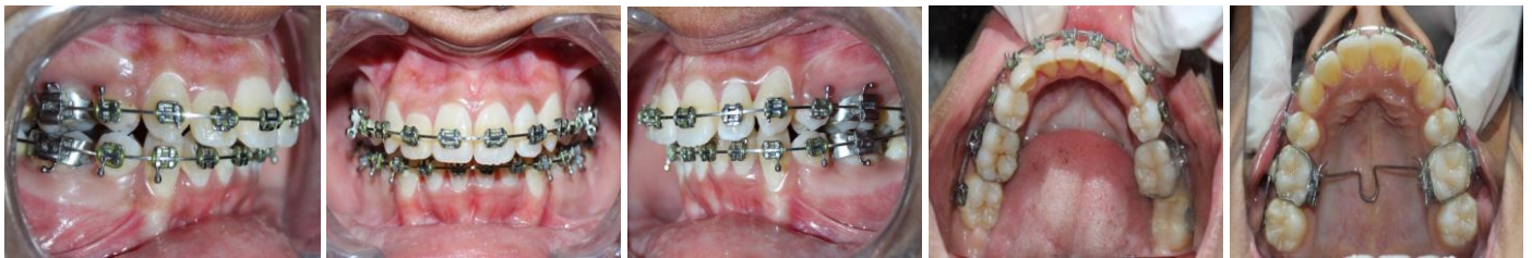
Fig 1: 16years-year-old female patient with proclined upper incisor and class II divI relationship on mild skeletal class II base after leveling and alignment on 19-25SS