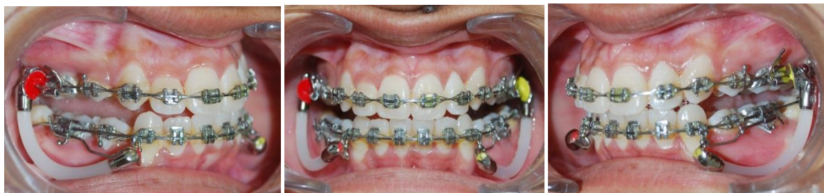
Fig 2: After insertion of Flex Developer on 19.25ss wire

upper and lower first molars, respectively. Leveling and alignment were carried out with sequential archwires, progressing up to full-size 19" x .025" stainless steel. Hooklet of bypass arch situated between the lower canine bracket and lower first premolar bracket. The distance between the anterior surface of the headgear tube and the anterior end of the bypass arch is measured with flex developer ruler. Then, Bilateral 36mm Flex Developer were then attached from the upper first molars to the distal lower canine. (Fig.2)