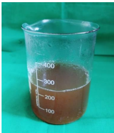
Fig 1: Preparation of the tea solution (Camelia sinensis)

Tea solutions were prepared from the extracts of camelia sinensis (organic India). Each group of samples have been immersed in this solution about 24hrs for 10 days [9].