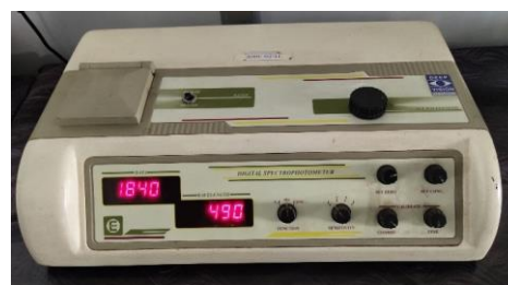
Fig 4: Spectrophotometer reading

The specimen was then bleached with carbamide peroxide at 17%, the color specimen was measured by the spectrophotometer according to the CIW L*a*b system [9]. The color difference h-index (DEab*) between each measurement was calculated. Various studies reported the advantages of using the CIE L*a*b* coordinate system, such as its repeatability, sensitivity, and objectivity [1]. This technique is well suited for the determination of small color variations ( \Delta E ).