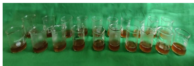
Fig 3: Immersion of samples in tea

The micro hybrid composite (te econom plus) and alkasite composite resin (cention- N) were polymerized with a curing light (celaux II, Voco, Cuxhaven, Germany) into 160 silicon molds (4mm in diameter and 2mm in thickness) to obtain identical specimens. 2 Ten samples from each composite and alkasite resin were prepared and the specimen were polished using an automated polishing machine with sequence of 600, 800, 1000 grid abrasive paper under water irrigation [5].