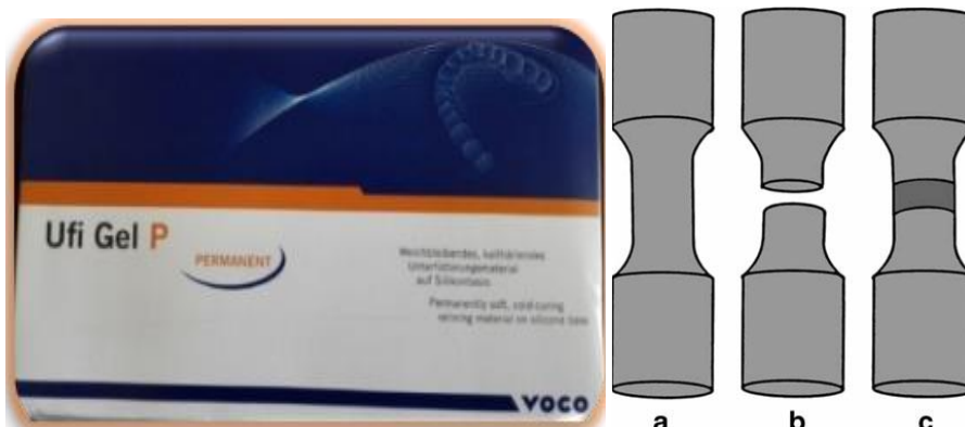
Fig 2: Specimen preparation. a Dumbbell-shaped acrylic resin block. b 3 mm of material removed from thin mid-section. c After application of soft denture line

Group A-untreated (control): No treatment was applied to the acrylic resin specimen surfaces, this group served as a control. Group M-MMA monomer treatment for 180 s.