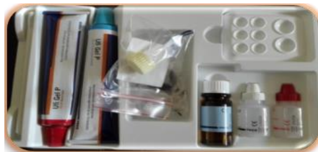
Fig 1: Autopolymerizing silicone based denture liner-Ufigel P

treatments applied. The bonding surface of the specimens received surface treatments, as follows: