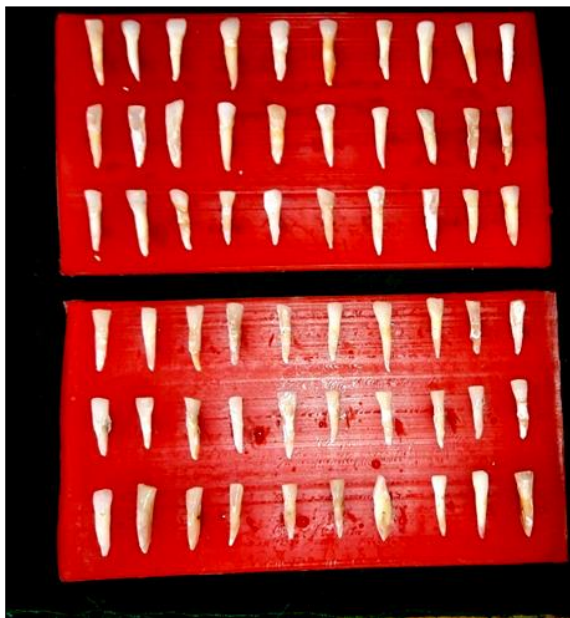
Fig 1: Collected Sample

extruded in both rotary and reciprocating groups. Every effort should be made to limit the periapical extrusion of intracanal material during treatment that has the potential to bring about serious systemic diseases such as endocarditis and septicemia, particularly in compromised patients. Further in vivo research in this direction could provide more insight into the biologic factors associated with correlations and consequences of apically extruded debris. Results of this study can be extrapolated to clinical conditions, but with caution because the presence of periapical and pulpal tissue may show resistance to apical extrusion of debris in clinical conditions.