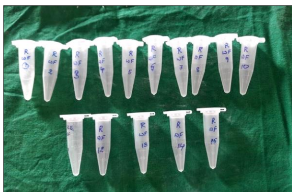
Fig 2: Eppendorf tubes