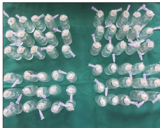
Fig 5: Grouping of samples