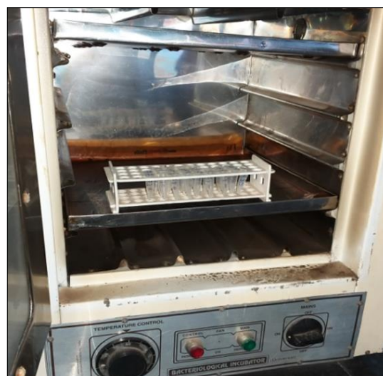
Fig 7: Incubator with eppendorf tubes