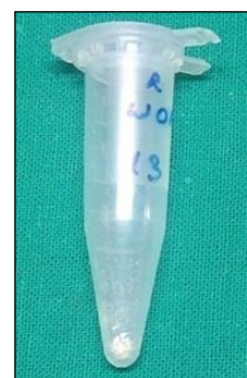
Fig 6: Eppendorf tube showing extruded dry debris