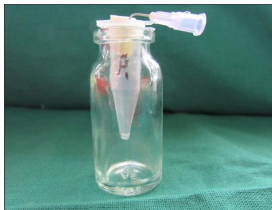
Fig 4: Collection assembly for apically extruded debris