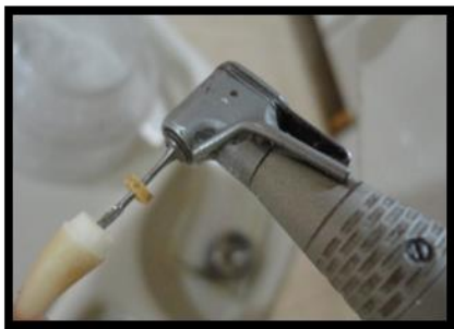
Fig 4: Post space preparing