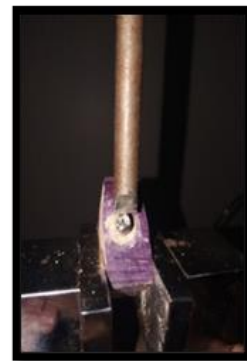
Fig 7: Universal load-testing machine

Compression resistance was recorded for each sample, and the statistical study was conducted for the results of the test