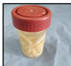
Fig 1: Sample of the research

Sample of this research consisted of 40 lower premolars.