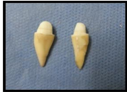
Fig 5: Composite cores building