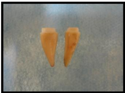
Fig 3: Teeth preparing