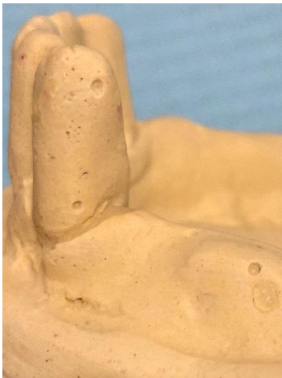
Fig 3: Identifying three holes representing angles of cervical convergence of the abutment tooth