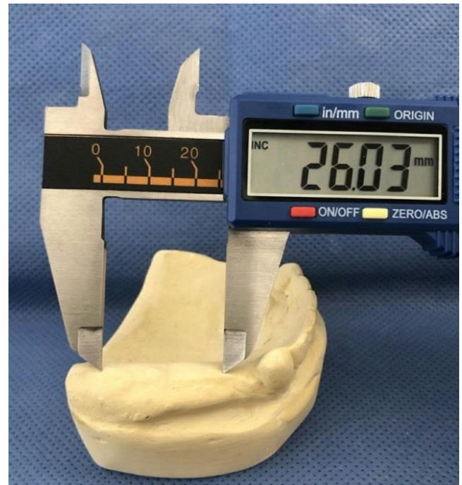
Fig 1: Measuring the distance between the two points using the digital ruler

Measuring the linear distance between the predetermined points on the surface of the models: Where specific points were identified on study models and the distance between these points was measured using a digital ruler, and these points were also read and measurements made between them on digital models and recorded on the computer, Note that the previous measurements were repeated three times to avoid errors during the measurement process.