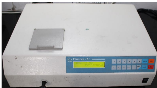
Fig 2: Digital Colorimeter showing pre-irrigation optical density readings.