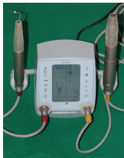
Fig 3: Obturating device (Elements, Sybron Endo) with temperature set at 180 °C.

the canal for 60 seconds. Irrigation in Subgroup III was done by attaching a down packer tip of ISO 15/04 to the obturating device (Elements, Sybron Endo) which was kept 3 mm short of the working length. The obturating device was set at 180 degree Celsius and activated for 3 seconds. 10 such cycles were repeated with replenishing the irrigant before each cycle. The excess irrigant was removed from the canal of all the samples by using absorbent paper points. In all the groups, 2 mL of irrigating solution was used for each sample. After irrigation procedure, dentinal shavings were collected from root canal of each tooth as previously mentioned and incubated for 24 hours at 37 °C. The optical density of the broth was measured using digital colorimeter and post irrigation readings were recorded.