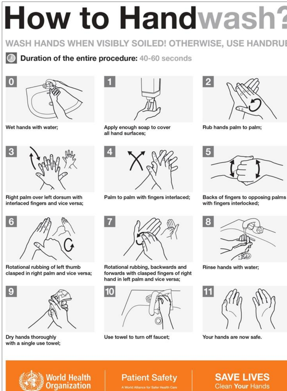
Fig 1: WHO Guidelines and steps how to hand wash.

be taken after touching the patient's documentation and the dentist should avoid touching their own eyes, nose, and mouth. The WHO guidelines on hand hygiene (6 steps) recommended that the duration of the entire procedure should be 40-60 seconds for hand washing [15] (Fig. 1) and 20-30 seconds while using alcohol-based hand rub (ABHR) [16] (Fig. 2).