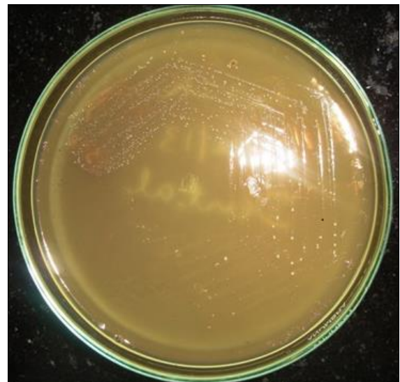
Fig 4: Growth of organisms