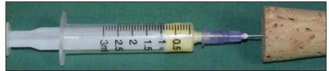
Fig 2: Sample in the syringe with widen cork

Sample processing was done in the following way: Direct microscopy for Bacterial morphology: A thin smear of the pus sample was made on a clean glass slide and allowed to air dry. Smear was gently heat fixed, stained by Gram staining technique and examined under oil immersion objective of the light microscope, for the presence of pus cells, Gram positive and Gram negative organisms. The size, shape and arrangement of bacteria were noted.