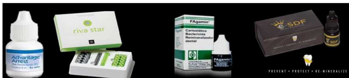
Fig 1: Original