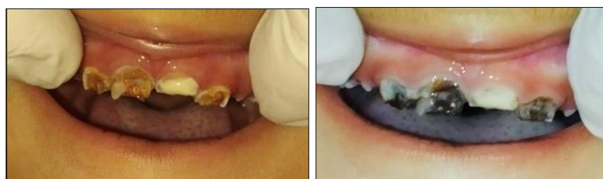
A. Enamel and dentin caries lesions in primary anterior teeth of 18-month-old child B. Same lesions showing staining after SDF treatment