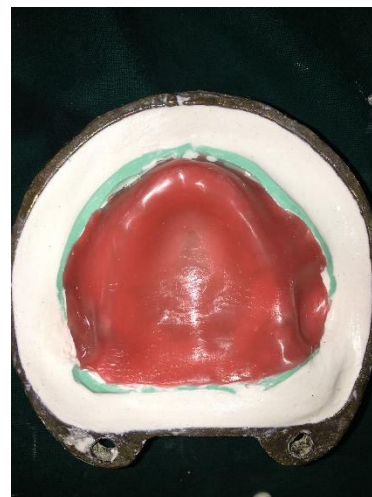
Fig 5: 2mm thickness modelling wax adapted