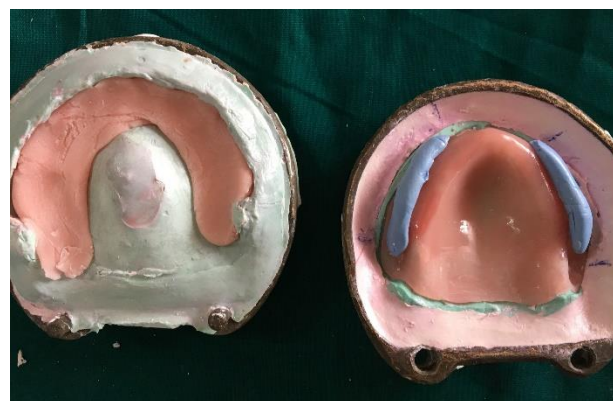
Fig 7a: Attachment of silicone putty to denture base and packing