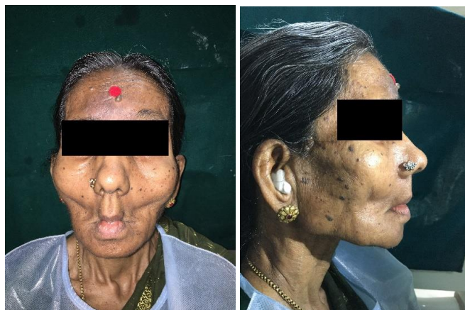
Fig 1: Extraoral view- frontal and lateral