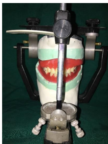
Fig 3: Waxed up dentures