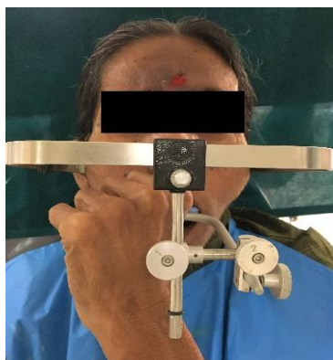
Fig 2: Facebow transfer