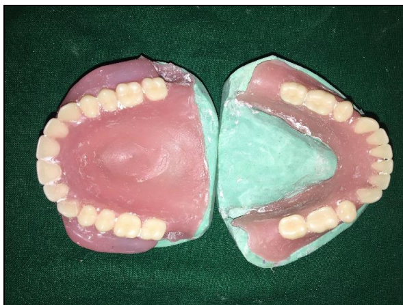
Fig 7b: Retrieval of dentures after acrylization