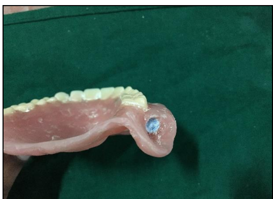
Fig 8: Opening of 5mm diameter