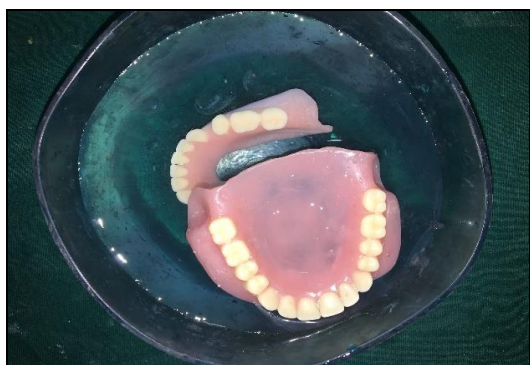
Fig 9: Finished and polished dentures