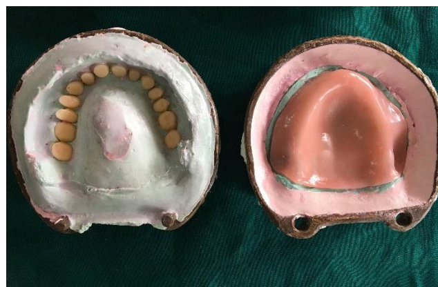
Fig 6: Post dewaxing, adaptation of denture base