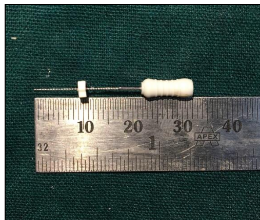
Fig 4b: Thickness of adapted wax was 10mm