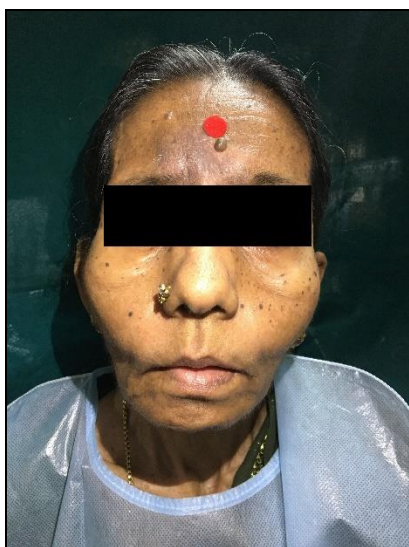
Fig 10: Extraoral frontal view