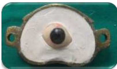
Fig 8: Final Eye Prosthesis after processing and characterization.