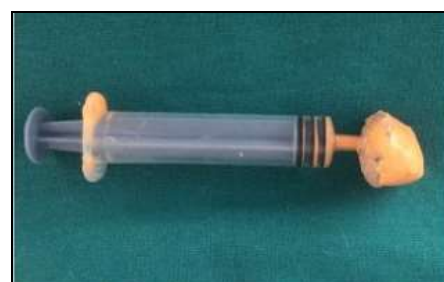
Fig 4: Final impression recorded using custom made shellac.