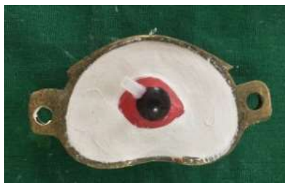
Fig 7: Wax pattern ready for flasking, stabilized by acrylic hold.