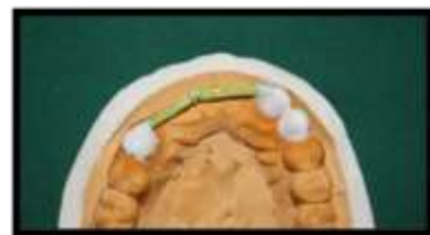
Fig 4: Wax Pattern for casting