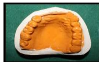
Fig 7: Final Cast