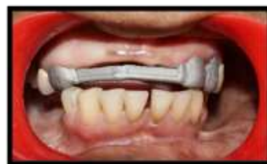
Fig 5: Metal Trial