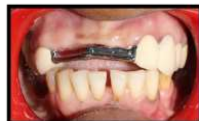
Fig 6: Fixed Retainers with the Bar