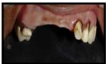
Fig 2: Tooth Preparation with 14, 22, 23