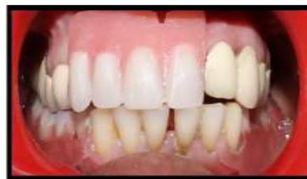
Fig 12: Post-operative Frontal View