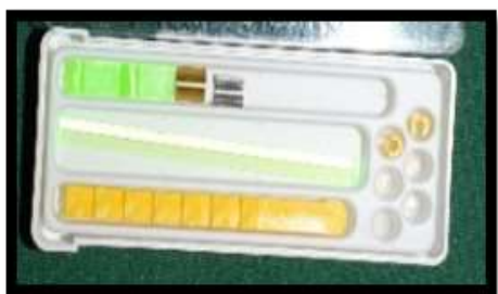
Fig 3: Ceka Preci-Horix Attachment