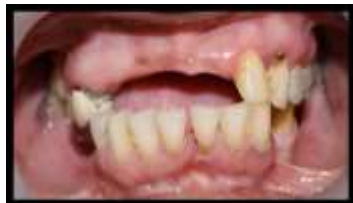
Fig 1: Pre-operative View

But there was a failure of the prosthesis due to caries and mobility of the abutment teeth and hence the abutment teeth 13 and 21 were extracted 5 months back. She had a previous PFM Crown on 14 which had porcelain chipped off exposing the metal which had to be replaced. Seibert's class 2 defect was seen with the edentulous ridge. Andrews bridge system was selected as the best fixed-removable prosthesis for this case to achieve optimum function and esthetics and to avoid coverage of the palate by a completely removable prosthesis.