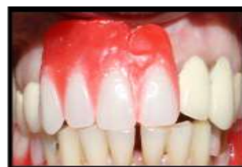
Fig 8: Try-in of the Removable Component