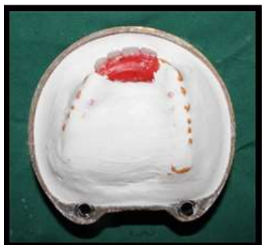
Fig 9: Flasking