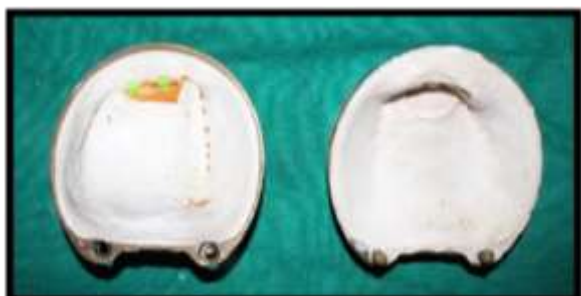
Fig 10: Placement of plastic green clips during processing

After dewaxing, the plastic green clips provided in the Preci-horix Attachment kit were placed on the bar at appropriate positions. These clips were used to create space for the pickup of the metal housing and plastic yellow retentive sleeves in the final denture.(Fig.10).The mould space was then packed with heat cured polymethylmethacrylate (PMMA) resin (Dental Products of India DPI,) and polymerized. After completion of polymerization, the green plastic clips were carefully teased out from the intaglio surface of the prosthesis. The prosthesis was finished and polished.