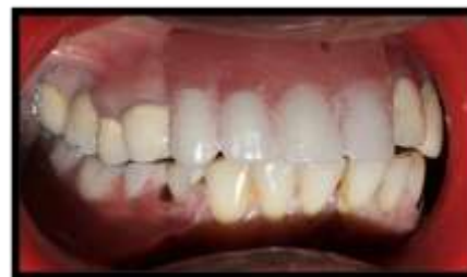
Fig 13: Post-operative Lateral View