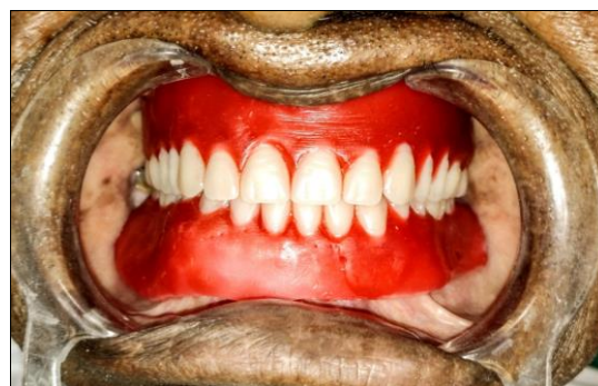
Fig 6: Try-in