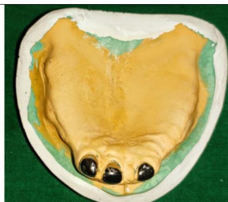
Fig 8b: Casted metal coping