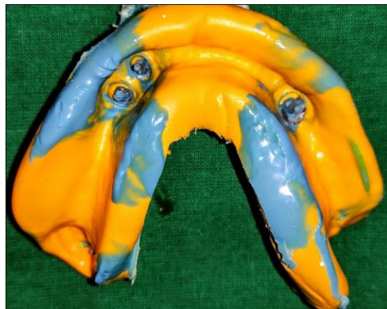
Fig 3: Pick-up impression