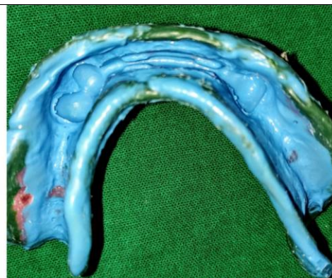
Fig 5b: Final impression