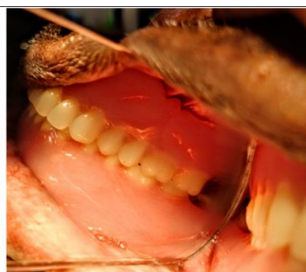
Fig 11: Final upper and lower denture