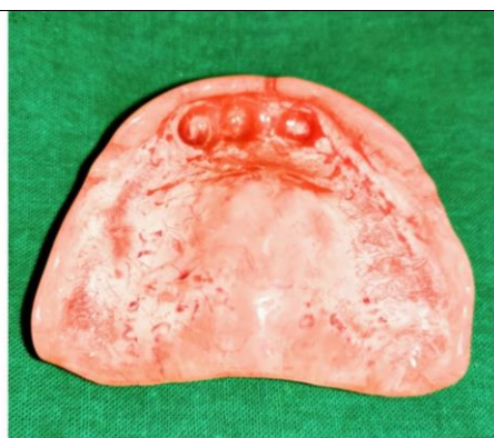
Fig 10: Fabricated denture