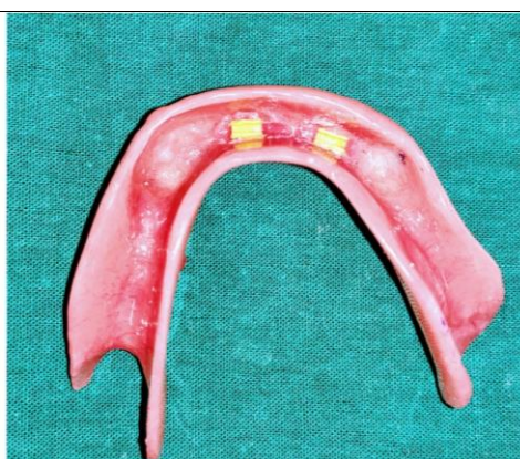
Fig 7: Final prosthesis with retentive clips