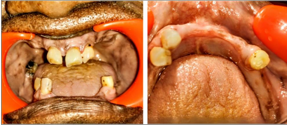
Fig 1: Pre-operative intra-oral photographs

articulator (for tentative jaw relations). This was performed to verify the interocclusal space, and it was found to be adequate and satisfactory for bar attachments.