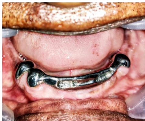
Fig 5a: Cementation of bar and copings