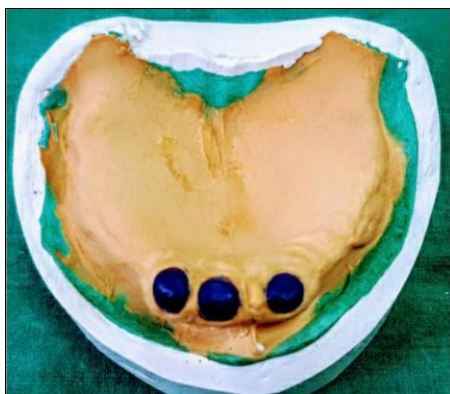
Fig 8a: Wax pattern for coping

of the prosthesis and post insertion instructions were given. The maintenance and importance of denture hygiene was explained in detail. Post insertion follow up visits were done at 1 day and 7 days. The patient was satisfied with the prosthesis (figure 11).