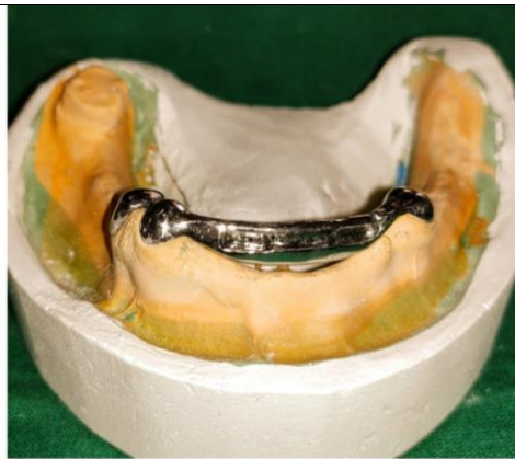
Fig 4b: Casting