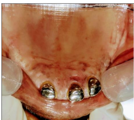
Fig 9a: Cementation of coping