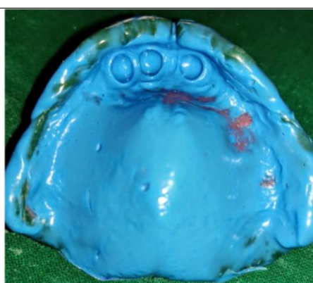
Fig 9b: Final impression