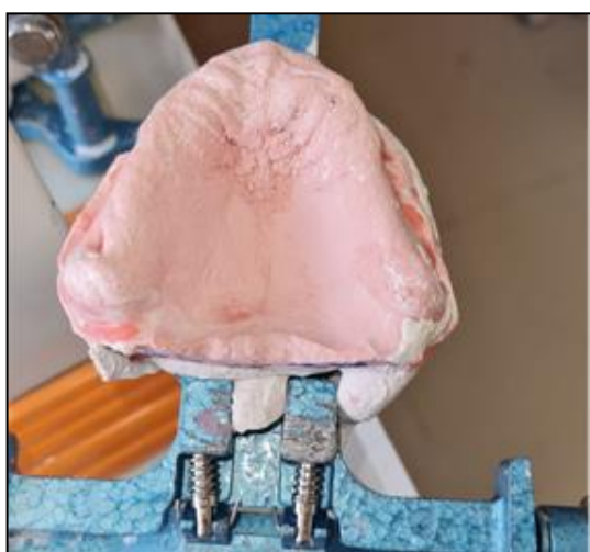
Fig 2: Post dam area on dental cast