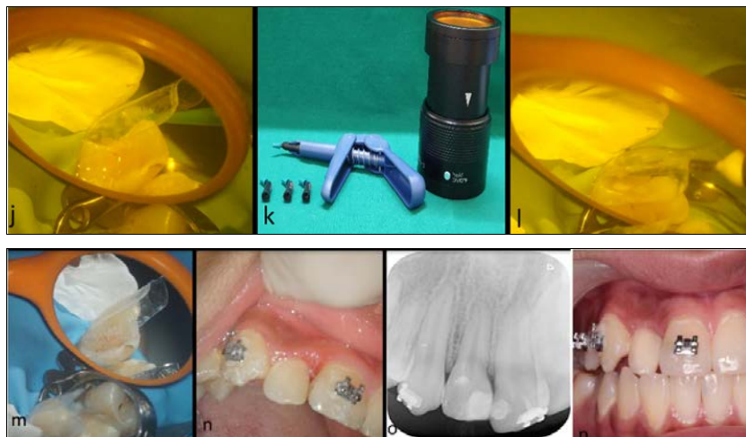
Fig 1: j) Application of Bioclear matrix with universal bonding agent. k) Preheating device used in injecting moulding technique. l) Application of flowable composite resin. m) Injection molding technique with preheating composite. n) Immediate post-operative clinical view after finishing and polishing. o) Immediate post-operative radiographic view. p) 6 months follow up

2.2. Case 2: A 25year old female patient reported to the Department of Conservative Dentistry and Endodontics with the chief complaint of pain with respect to the left maxillary second premolar since 2 weeks. Clinical examination revealed mesio-proximal caries with 25 (Fig. 2 a) and radiographic examination confirmed deep mesio-proximal caries involvement approaching the pulp chamber and root canal treatment was planned (Fig. 2 b). The first premolar (24) was previously endodontically treated which was underfilled due to which the patient was advised a retreatment with 24. No other periapical pathology was recorded. Post the administration of a short acting anesthetic (2% lidocaine), caries was excavated completely, exposing subgingival margins and gingivectomy was performed using Gingiburs as used in the previous case (Fig. 2 c). The cavity could now be isolated under the rubber dam (Fig. 2 d) and teflon tape was used to further isolate the gingival margin. A sectional matrix