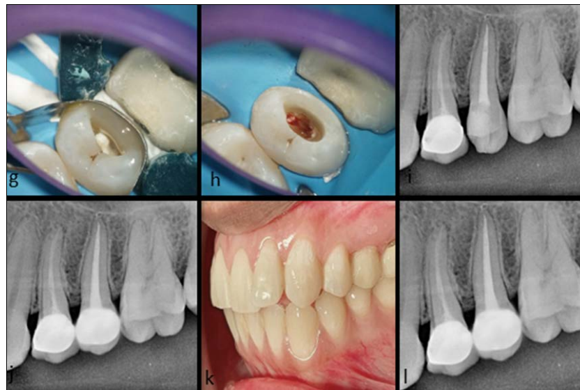
Fig 2: g) Application of packable composite for DME in snowplow technique. h) Completion of pre-endodontic buildup & initiation of root canal treatment. i) Radiograph showing DME with preendo buildup & completed root canal therapy with 25. j) Post-operative radiograph. k) Emax full crowns delivered with 25. l) Radiographic image showing 6 months follow up.

2.3. Case 3: A 37year old male patient reported to the Department of Conservative Dentistry and Endodontics with the chief complain of a fractured restoration, food lodgement and a mild sensitivity with respect to the right mandibular first molar. Clinical examination revealed a fractured amalgam restoration with respect to the disto-proximal surface with marginal gaps at the tooth-restorative interface (Fig. 3 a). Radiographic evaluation revealed the presence of secondary caries below the gingival seat and a close proximity of the restoration to the distal pulp horn. The lamina dura and the periapical status were unremarkable (Fig. 3 b). Pulp sensibility test confirmed the status of the pulp to be vital. Post the administration of a short acting anesthetic (2% lidocaine), the cavity was then well isolated using a rubber