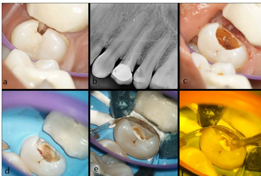
Fig 2: a) Pre-operative clinical view with a mesial subgingival margin. b) Radiographic evaluation of the extent of caries involvement with 25. c) Excavation of caries and gingivectomy done using gingiburs. d) Rubber dam isolation done. e) Application of saddle matrix using Teflon floss and Palodent ring. f) Application of flowable composite for DME in snowplow technique.

system (Palodent) was used. Owing to inadequate space at the deep cervical margin to place a wedge, Teflon floss was used to adapt the band at the gingival margin (Fig. 2 e). The cavity was then etched using 35% phosphoric acid and bonded using a universal bonding agent (Single bond universal adhesive, 3M, ESPE, USA). In this case, the margins were elevated using Snowplow Technique (i.e. incorporation of flowable along with packable composite restorations (Filtek bulk fill flow able with Filtek Z330XT Universal restorative, 3M, ESPE, USA) as a gingival liner followed by pre-endodontic build up (Fig. 2 f, g, h). Conventional endodontic therapy was carried out, post endodontic restoration with Z350XT was done and an Emax crown was delivered with the same (Fig. 2 i, j, k, l). The patient was kept on follow up. Gingival health was recorded at subsequent appointments and found to be satisfactory.