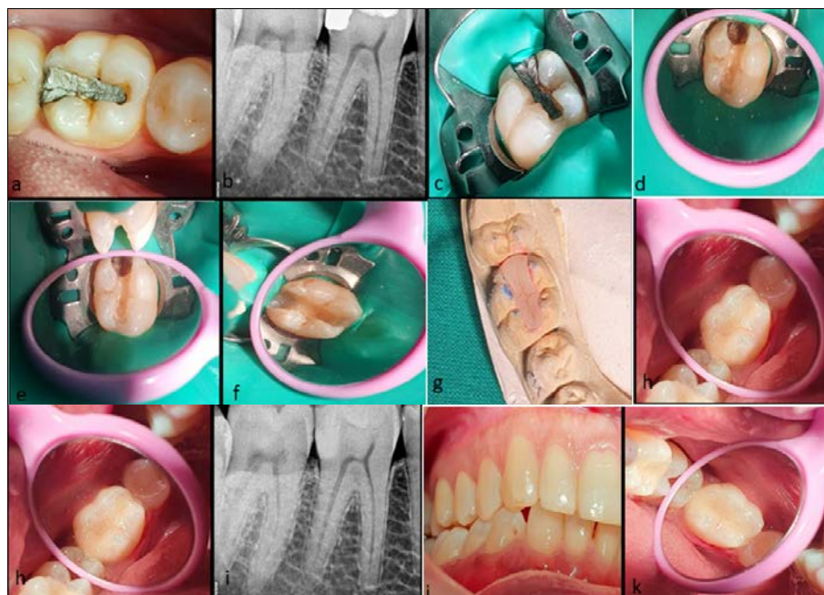
Fig 3: a) Clinical image showing the fractured amalgam restoration. b) Pre-operative radiographic image showing proximity to the distal pulp horn. c) Rubber dam isolation done. d) Presence of undermined caries below the past restoration. e) Post caries excavation. f) Post deep margin elevation using bulk fill composites in snowplow technique. g) Prefabricated indirect restoration on the diagnostic cast. h) Post cementation of the indirect restoration. i) Radiographic appearance showing the indirect restoration over an elevated margin. j) Evaluation of the bite post cementation. k) 6 months follow up post cementation.

dam (Fig. 3 c). Post removal of the past restoration, undermined infected dentin (secondary caries) was present below the gingival seat (Fig. 3 d) which on removal resulted in a subgingival cavity margin (Fig. 3 e). The margin was then elevated with a sectional matrix system (Palodent) along with the use of bulk fill composites (BFCs) in snowplow technique (Filtek bulk fill flowable with Filtek Z330XT Universal restorative, 3M, ESPE, USA) and brought to a supragingival level (Fig. 3 f). This level was then verified radiographically for a good adaptation over which an indirect ceramic restoration was fabricated (Fig. 3 h, i, j). The last image shows a 6months follow up of the restoration without any initiation of secondary decay and a sound periapical status too (Fig. 3 k).