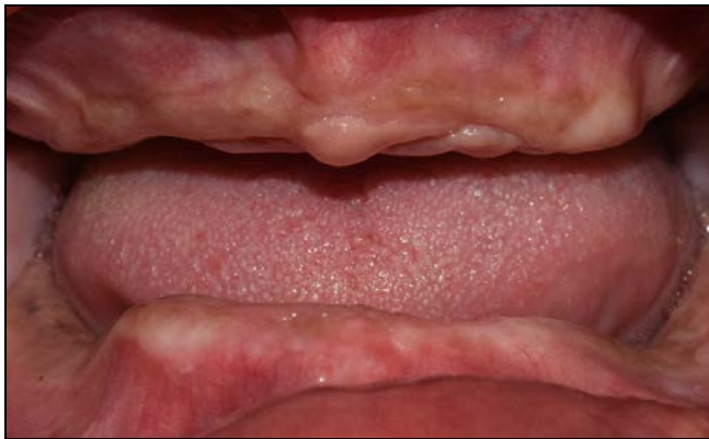
Fig 2: Close up intraoral photograph.