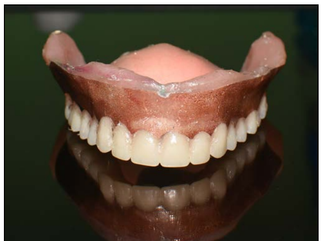
Fig 5: Final denture prosthesis.