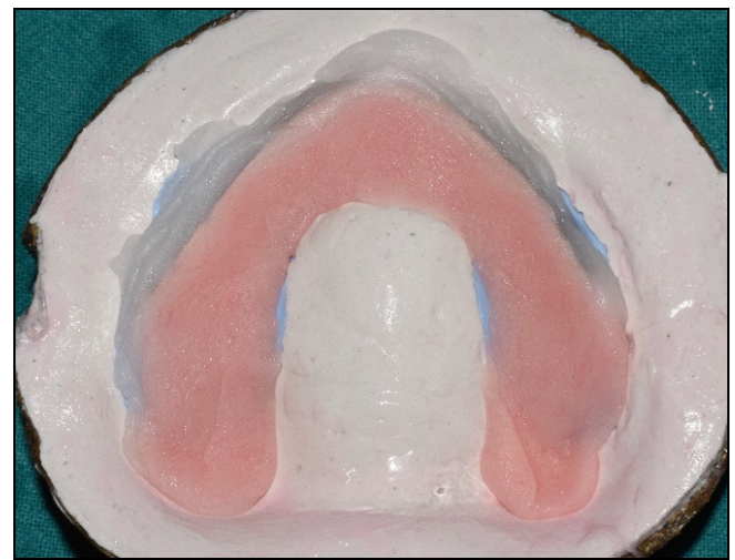
Fig 4B: Photograph embedded against clear acrylic followed by pink PMMA packing.