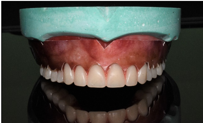
Fig 3A: Printed photograph cut according to denture's gingival contours