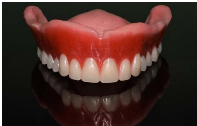
Fig 1: Waxed up denture.