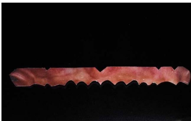
Fig 3B: Cut photograph post sealed with modge-podge.