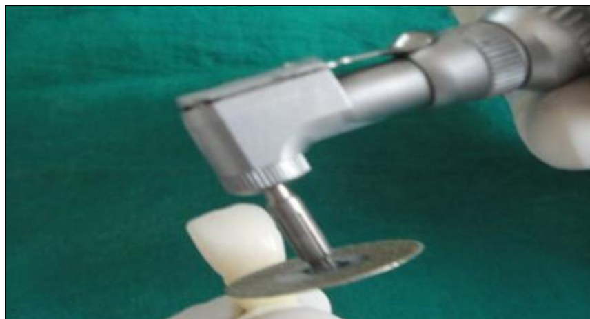
Fig 1: Decoronation of tooth

There was a trend of potential dye substances, such as brandy or red wine, to exert influence in the final color; therefore, the consumption of highly colored food and beverages should be decreased. Moreover, high mineral loss was observed when the enamel was exposed to acidic drinks that could decrease the staining resistance by superficial changes of the dental enamel, making extremely important the guidance to avoid intake of acidic substances, especially during bleaching treatment.