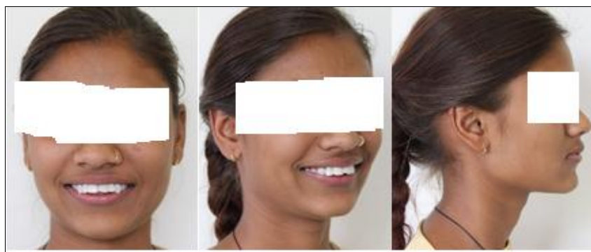
Fig 1: Photographs of extra oral pretreatment

With SNA = 82^\circ and SNB = 81^\circ , cephalometric interpretations suggested a normal maxilla and mandible. An ANB of 1^\circ indicated that the patient's skeletal pattern was Class I. He had an acute gonial angle and a horizontal growth pattern, with GoGn-Sn = 24^\circ and FMA = 20^\circ values. The maxillary central incisors were proclined and forwardly positioned, with a UI-NA linear of 14mm and an angular angle of 55^\circ . The mandibular incisors were also proclined and retropositioned, with LI - NB linear -5mm, angular 25^\circ , and IMPA of 98^\circ . In soft tissue, the upper lip - S line was 0mm, indicating a protruding upper lip, while the lower lip - S line was 0mm, indicating a protruding lower lip. The nasolabial angle was measured at 97^\circ . (Fig.3).