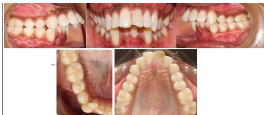
Fig 2: Photographs of Intraoral Pretreatment