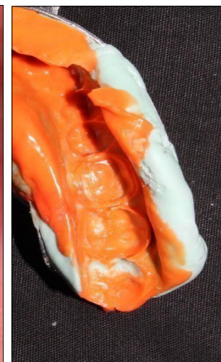
Fig 33: Impression