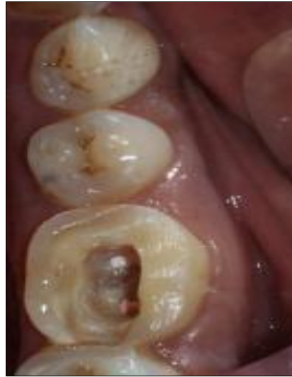
Fig 8: Endocrown preparation