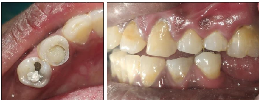
Fig 23 and 24: Pre-operative