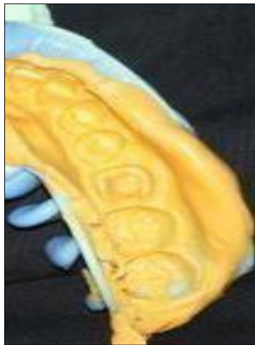
Fig 9: Putty Impression