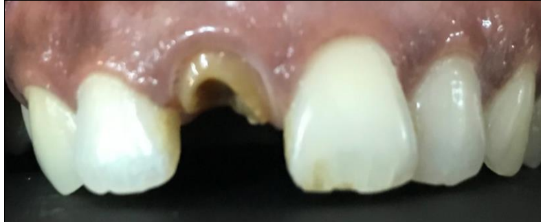
Fig 1: Pre-operative

resin (GC India) was used for making the pattern of the canal. (Figure 2 and 3) A single unit Zirconia post and core was fabricated using CAD-CAM milling technique. (Figure 4). After evaluating the zirconia post and core intra orally, luting was done using resin luting cement. After the completion of tooth preparation impression was made with polyvinyl siloxane impression material of light and putty consistency using a double-mix single-stage technique for the fabrication of crown. (Figure 5 and 6).