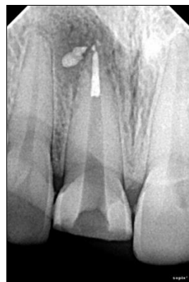
Fig 2: Post-space preparation