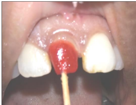
Fig 3: Pattern using pattern resin