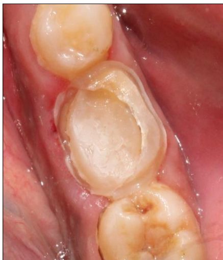
Fig 32: Tooth Preparation