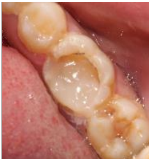
Fig 31: Pre-operative