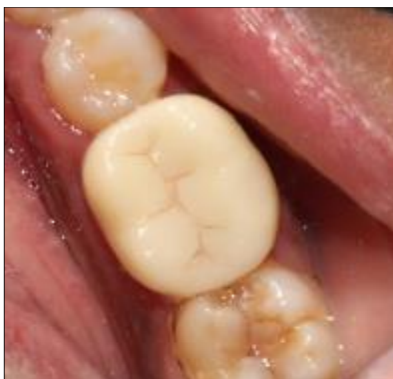
Fig 34: Post-Cementation