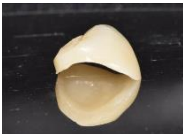
Fig 28: Fabricated Vonlay

in the lower left back region of jaw. Radiographic and clinical examinations concluded for endodontic treatment with respect to 36. Following endodontic treatment, post endodontic treatment planning was planned after patient’s oral hygiene considerations was acceptable and a favourable occlusion and aesthetic consideration zirconia overlay restoration was fabricated with 36. (Figure 31).