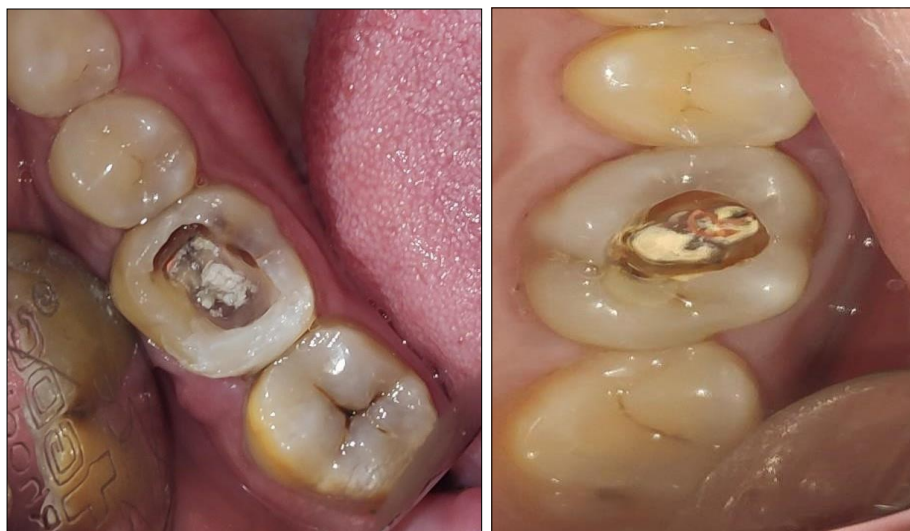
Fig 12 and 13: Pre-operative

After verifying the fit, the crownlays was cemented intraorally using resin luting cement. The inner surface was etched with 10% hydrofluoric acid was washed with water and dried. Silane coupling agent was applied for 1 min and dried. The tooth was etched for 10 seconds and washed and dried using botting paper. Adhesive was applied and cured for 20 secs. Resin cement was applied on the inner surfaces and crownlays was cemented using light cure. The gross occlusal discrepancies were marked with articulating paper strips and later removed before cementation. Post cementation radiographic view showed appropriate seating of the crown. (Figure 20, 21, 22).