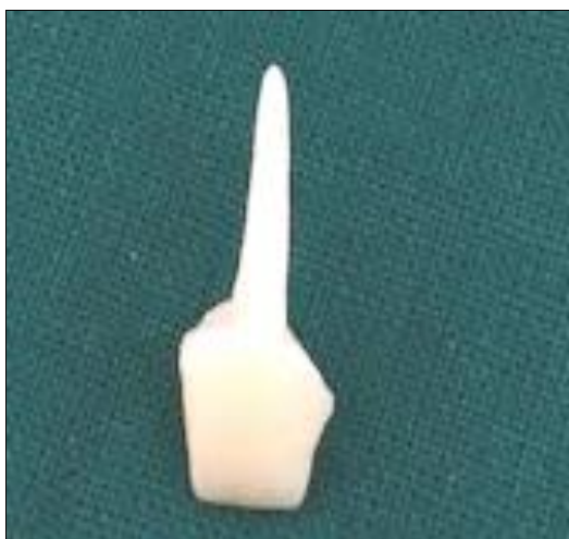
Fig 4: Fabricated Zirconia Post and Core