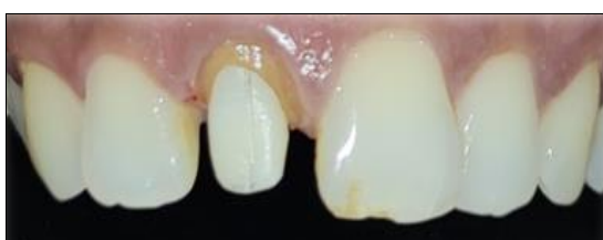
Fig 5: Post Cementation