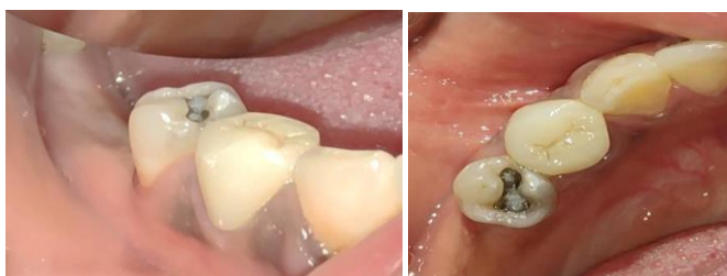
Fig 29 and 30: Post-operative

After verifying the fit, the overlay was cemented intraorally using resin luting cement. The inner surface was etched with 10% hydrofluoric acid was washed with water and dried. Silane coupling agent was applied for 1 min and dried. The tooth was etched for 10 seconds and washed and dried using botting paper. Adhesive was applied and cured for 20 secs. Resin cement was applied on the inner surface and overlay was cemented using light cure. The gross occlusal discrepancies were marked with articulating paper strips and later removed before cementation. (Figure 34).