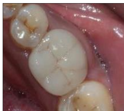
Fig 11: Post Cementation