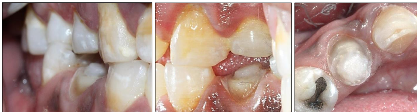
Fig 25-27: Tooth Preparation