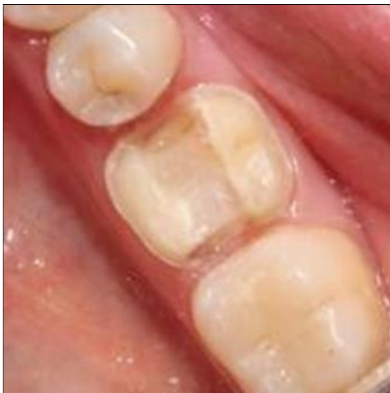
Fig 36: Tooth preparation