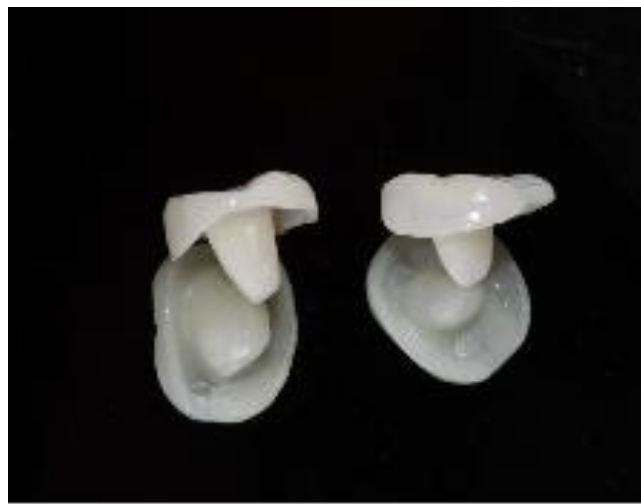
Fig 19: Fabricated Crownlay