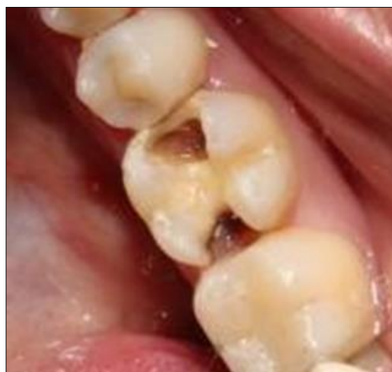
Fig 35: Pre-operative

After verifying the fit, the onlay was cemented intraorally using resin luting cement. The inner surface was etched with 10% hydrofluoric acid was washed with water and dried. Silane coupling agent was applied for 1 min and dried. The tooth was etched for 10 seconds and washed and dried using botting paper. Adhesive was applied and cured for 20 secs. Resin cement was applied on the inner surface and onlay was cemented using light cure. The gross occlusal discrepancies were marked with articulating paper strips and later removed before cementation. (Figure 38).