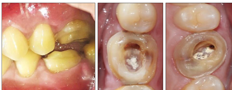
Fig 14-16: Tooth Preparation