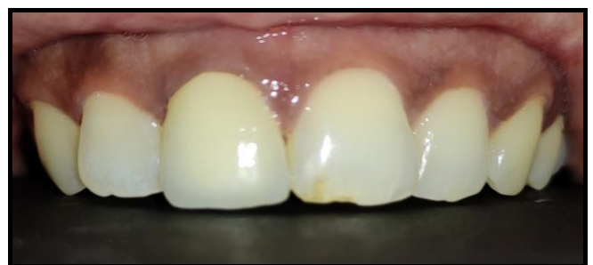
Fig 6: Post-operative