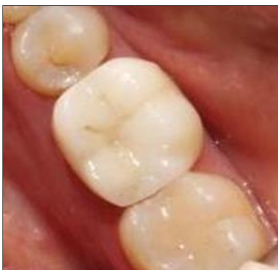
Fig 38: Post-operative