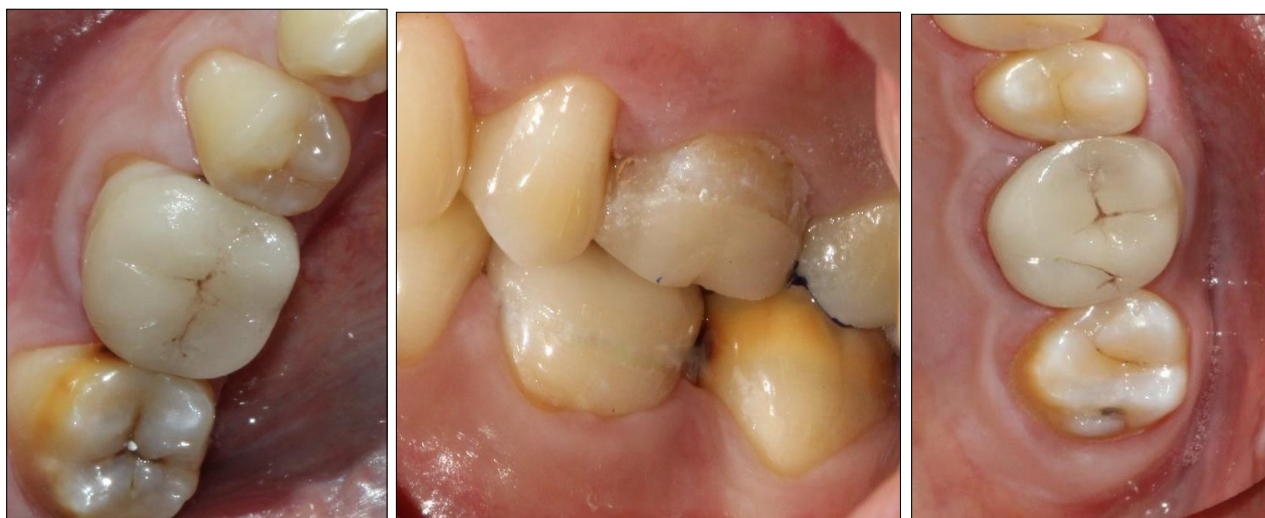
Fig 20-22: Post-operative