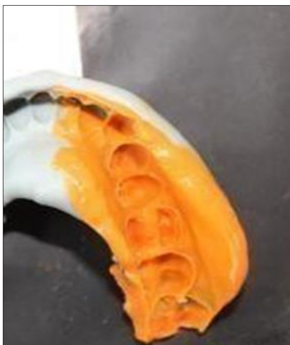
Fig 37: Impression