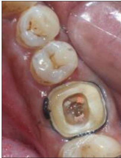
Fig 7: Pre-operative

of tooth preparation impression was made with polyvinyl siloxane impression material of light and putty consistency using a double-mix single-stage technique. (Figure 9) The Lithium Disilicate was milled using CAD/CAM milling technique. (Figure 10) After verifying the fit, the endocrown was cemented intraorally using resin luting cement. The inner surface was etched with 10% hydrofluoric acid was washed with water and dried. Silane coupling agent was applied for 1 min and dried. The tooth was etched for 10 seconds and washed and dried using botting paper. Adhesive was applied and cured for 20 secs. Resin cement was applied on the inner surface and endocrown was cemented using resin cement. (Figure 11).