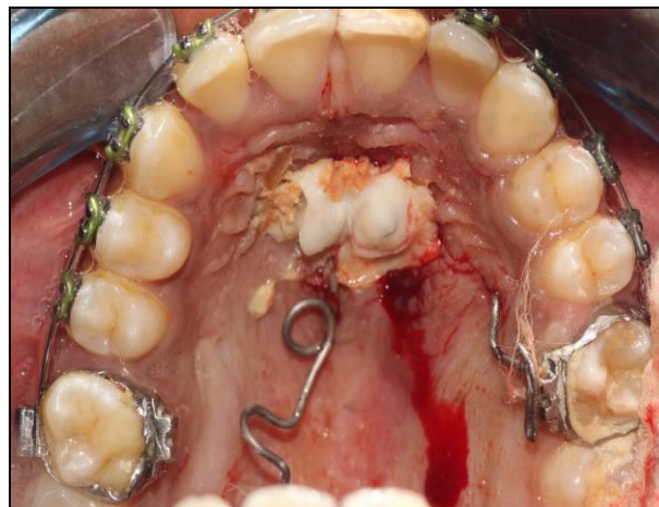
Fig 3: Removal of acrylic button to access mini-implants

removed a week later (figure 5). All the removed components of the appliances were assessed to eliminate the possibility of entrapping the remaining parts (figure 6). Postoperative instructions were given, and the patient was prescribed antibiotic Amoxicillin 500 mg thrice daily for 3 days and analgesic Aceclofenac (100 mg) and paracetamol (500 mg) combination, twice daily for 3 days. Betadine mouth rinse was prescribed twice daily for one week. Healing was uneventful, with minimal discomfort (figure 7).