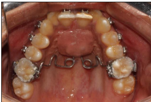
Fig 1: Mini-implant-supported pendulum appliance

During the follow-up visit, mucosal entrapment of the palatal appliance was observed (figure 2). An intraoral inspection revealed that the wire component of the appliance on the left side was embedded in the hard palatal mucosa. The mucosal cover did not show any signs of inflammation or bleeding. The affected area was non-tender upon palpation. The clinical findings suggested that the overlying soft tissue was non-inflammatory and occurred due to forceful impingement of wire component on the palatal mucosa.