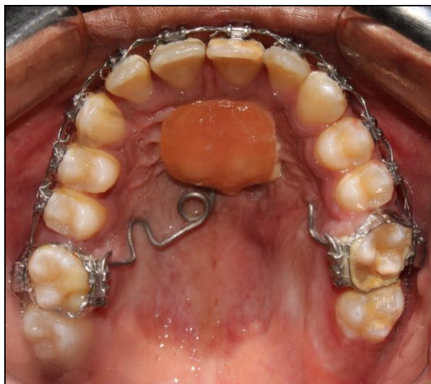
Fig 2: Partial palatal soft tissue entrapment of orthodontic appliance

During the follow-up visit, mucosal entrapment of the palatal appliance was observed (figure 2). An intraoral inspection revealed that the wire component of the appliance on the left side was embedded in the hard palatal mucosa. The mucosal cover did not show any signs of inflammation or bleeding. The affected area was non-tender upon palpation. The clinical findings suggested that the overlying soft tissue was non-inflammatory and occurred due to forceful impingement of wire component on the palatal mucosa.