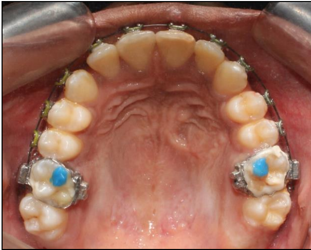
Fig 7: Post-operative healing