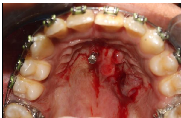
Fig 4: Removal of wire component and left mini-implant