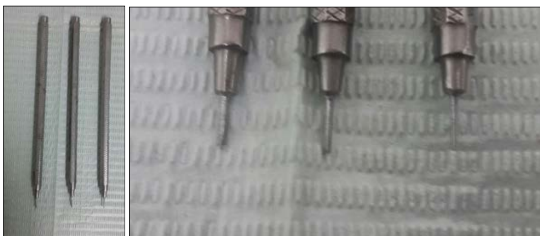
Fig 4: Stainless-steel cylindrical plunger of three different sizes 0.9, 0.7 and 0.55 mm

An application of load was carried out apico-coronally till failure of bond occurs, which was demonstrated by filling material extrusion as well as an instant drop in load. The maximum load prior to the failure occurrence was reported in newtons (N). The force was recorded using computer software Blue hill 3 version. The bond strength of push-out was calculated in megapascals (MPa) in accordance with the following formula: