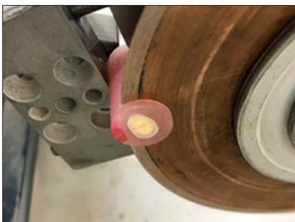
Fig 1: Buehler IsoMet 4000 micro-saw

Decoronation of the teeth was done at the cemento-enamel junction in such a way that the diamond disc is positioned perpendicular to the long axis of the root. This diamond disc was mounted in a hand piece of low-speed type. A root of approximately 16 mm was obtained after the decoronation process. Pink acrylic resin model was used to embed each root that had a 2 cm diameter, 3 cm height and 5 mm thickness of wall. After the acrylic resin had set, a precision saw Iso Met 4000 of low-speed water-cooled type was used to cut each root into three horizontal sections, a section belongs to the coronal one third, a section belongs to the middle one third, and a section belongs to the apical one third, Figure (1). Using a digital caliper, we determined the thickness of each slice, yielding to 30 horizontal sections for each group Figure (2). A marker was used to mark every section on its coronal side. An examination of each specimens' aspect was performed under stereomicroscope prior to testing to confirm that there are no signs of any dentin cracks or presence of voids in the filling materials.