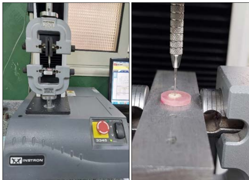
Fig 3: Universal Testing Machine