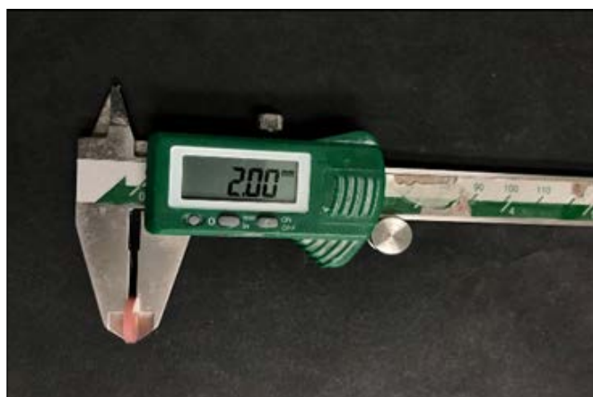
Fig 2: A digital calliper

To prevent sample movement during testing, all root slices were set up in a loading fixture. This was performed so that stress would be distributed equally. A universal testing machine was utilized to apply a compressive load to the filling of root canal solely in each section of root (Model Instron universal testing machine model 3345 England) at a