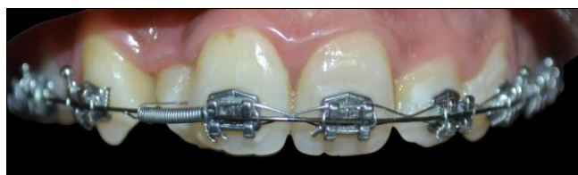
Fig 3: Open coil spring compressed to a third of its original length using ligature wire tied to the derotated tooth

The treatment objectives were to relieve crowding in the upper and lower anterior segment, correct the inclination of the upper incisors and to create space and derotate 12. Bonding of the teeth in the upper and lower arch was done using 0.018-in slot MBT brackets (Orthox; US Orthodontics). After placing the initial archwires for alignment, space creation and derotation of 12 was done using the ANG (Anghileri) technique. 0.016-in stainless steel wire was placed in the main bracket slot. A bondable button was bonded on the buccal surface of the rotated and palatally blocked-out lateral incisor 12. An open coil spring was placed between the brackets of 11 and 13 which was compressed to one-third its original length using a ligature wire, the other end of which was tied to a button bonded on the buccal surface of 12. (Fig 3).