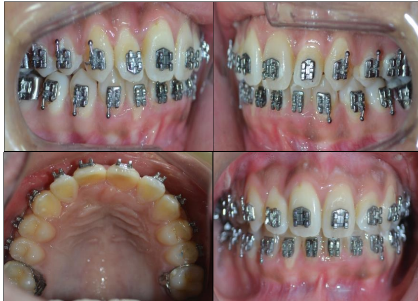
Fig 6a: Intra-oral photographs following alignment and levelling