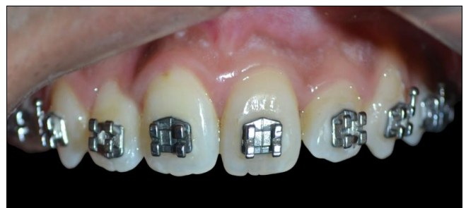
Fig 5: Alignment of the upper arch obtained after 3 months following derotation of 12

Following rotation correction, there was enough scope to engage the lateral incisor with flexible Ni-Ti wires for the purpose of alignment and levelling. The archwire sequence followed was 0.014-in CuNiti, 0.016-in CuNiti, 0.016-in X 0.022-in NiTi followed by 0.016-in X 0.022 stainless steel wire. Alignment of the upper arch was obtained after 3 months. (Fig 5, Fig 6a, 6b)