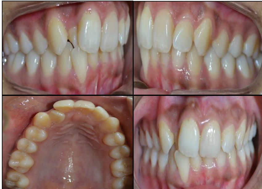
Fig 1: Pre-treatment intra-oral photographs