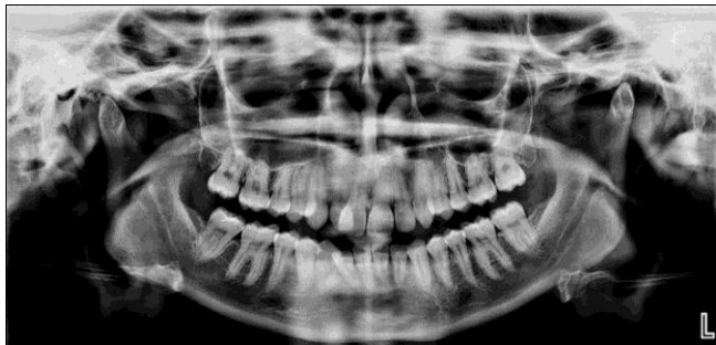
Fig 2: Pre-treatment OPG

The treatment objectives were to relieve crowding in the upper and lower anterior segment, correct the inclination of the upper incisors and to create space and derotate 12. Bonding of the teeth in the upper and lower arch was done using 0.018-in slot MBT brackets (Orthox; US Orthodontics). After placing the initial archwires for alignment, space creation and derotation of 12 was done using the ANG (Anghileri) technique. 0.016-in stainless steel wire was placed in the main bracket slot. A bondable button was bonded on the buccal surface of the rotated and palatally blocked-out lateral incisor 12. An open coil spring was placed between the brackets of 11 and 13 which was compressed to one-third its original length using a ligature wire, the other end of which was tied to a button bonded on the buccal surface of 12. (Fig 3).