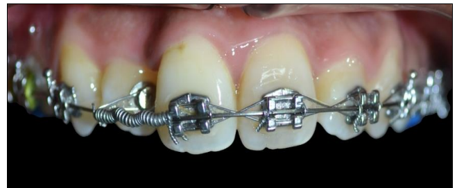
Fig 4: Rotation correction after 2 months of treatment

In this case, the lateral incisor was rotated mesially. The spring was compressed such that it provided a distally directed light constant force as it tried to open up. Rotation correction was obtained after 2 months and the tooth was ready to be ligated to the main archwire. (Fig 4)