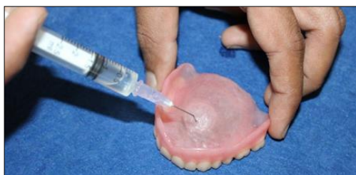
Fig 11: Injecting salivary substitute through holes in reservoir