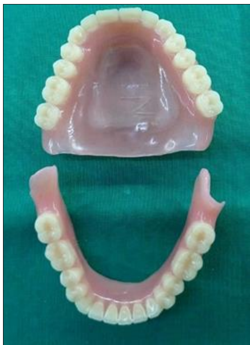
Fig 9: Final finished polished denture