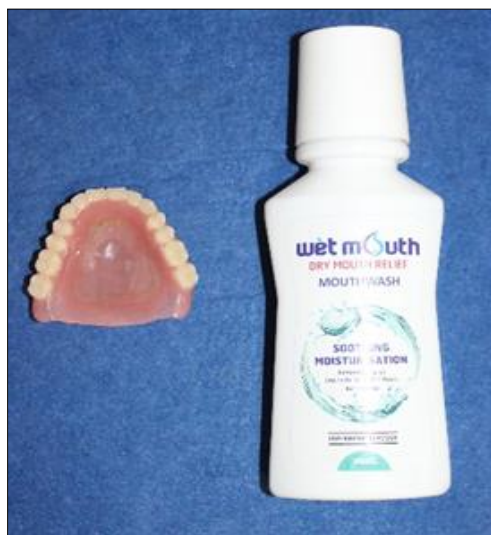
Fig 10: CMC salivary substitute liquid