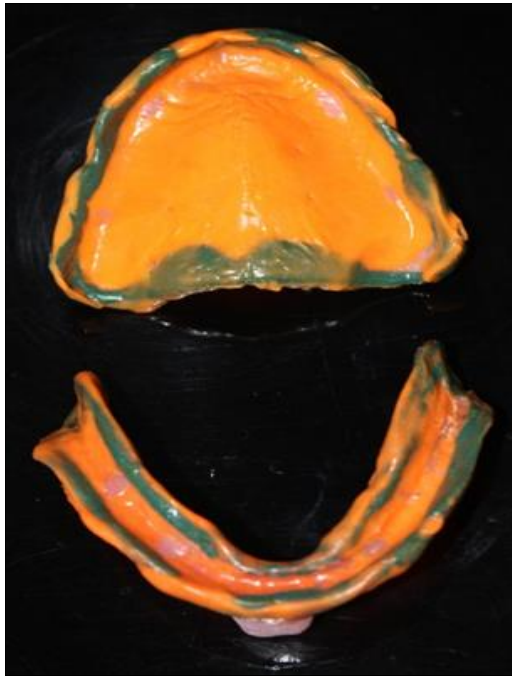
Fig 2: Final impressions