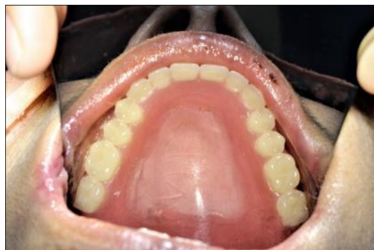
Fig 13: Maxillary fixed salivary reservoir