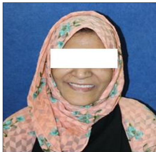
Fig 15: Postoperative