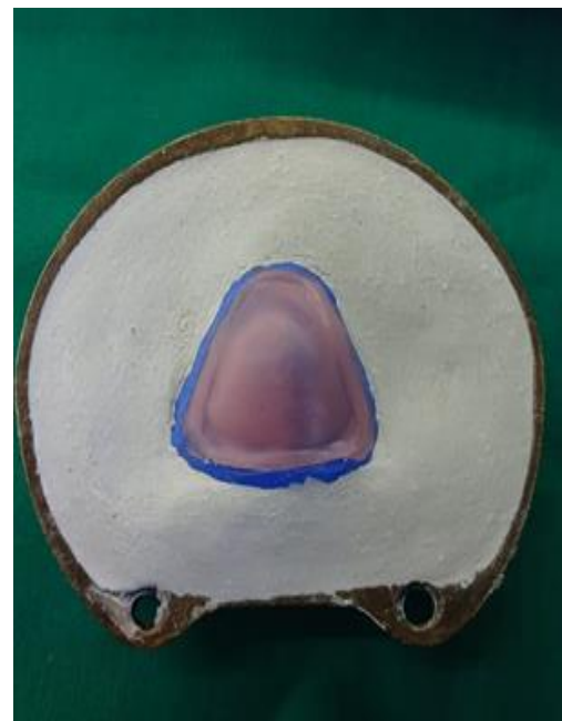
Fig 7: Flasking done