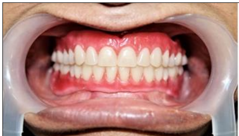
Fig 4: Waxed up denture trial