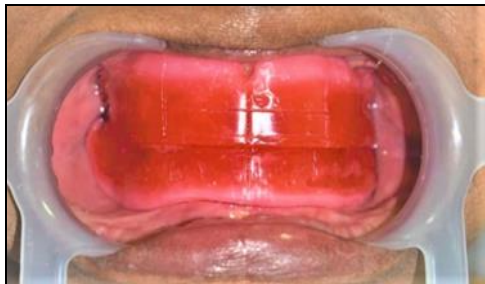
Fig 3: Maxillomandibular relationship