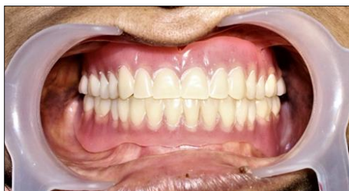
Fig 12: Final complete denture in occlusion