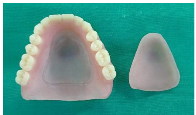
Fig 8: Processed maxillary denture and lid