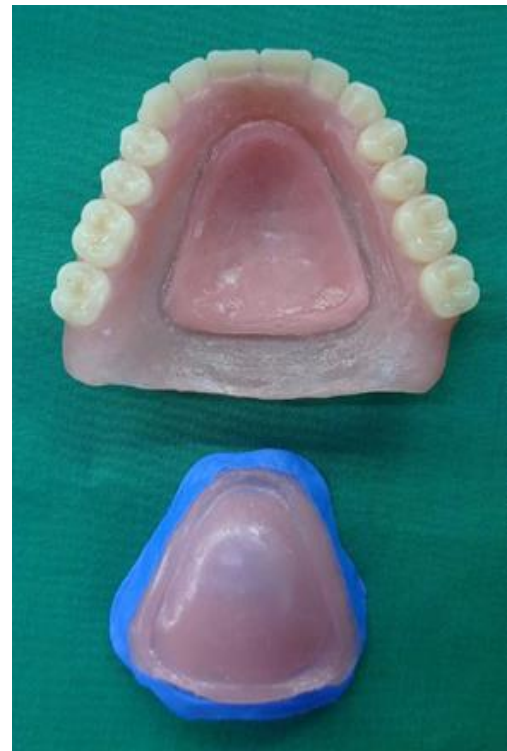
Fig 6: 1 mm of wax added on palate with carved margins and hard pink wax used to make lid with snap on attachment