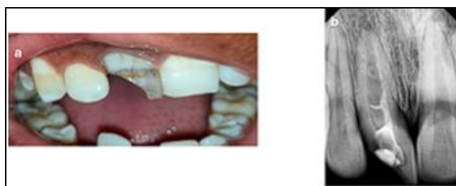
Fig 1: a) Pre-operative clinical of Ellis class IV fracture with 11. b) Pre-operative radiograph show in g wide open apex

In the "Department of Conservative Dentistry and Endodontics, K. D. Dental College, Mathura," a male patient, age 21, presented with the main complaint of a discoloured and cracked tooth in the upper right front region of her jaw. The patient described a fall-related trauma that occurred around eleven years ago. The patient didn't appear to be in any pain or swelling. A discoloured tooth with an Ellis Class IV fracture with 11 where the fracture line involved the pulp chamber without mobility was revealed by the clinical study (Figure 1a). The patient provided a history of starting root canal therapy at a nearby physician fifteen days prior.