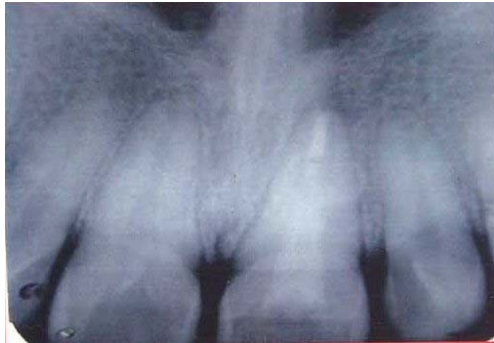
Fig 7: Post-Operative View Iopa