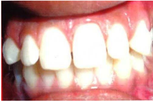
Fig 6: Post-Operative