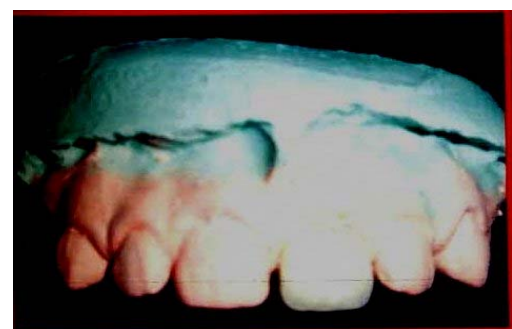
Fig 5: Hybrid Richmond Crown on Cast