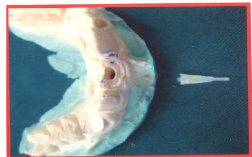
Fig 3: Cast and Conically Modified Glass Fiber Post