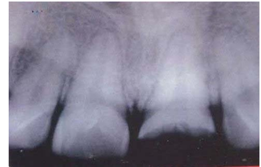
Fig 2: Pre-Operative Iopa X-Ray