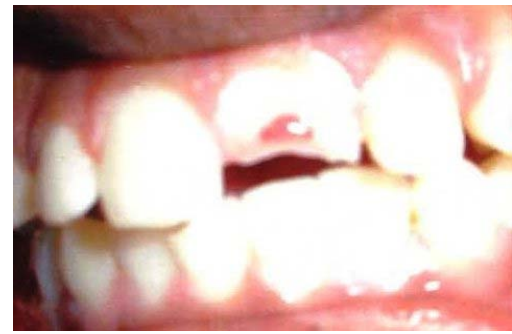
Fig 1: Pre-Operative View

. The custom modified conical post is initially bonded to the fractured tooth structure using ParaCem universal dual core cement (Coltene Whaledent, USA). Small retentive grooves prepared on the internal aspect of fractured crown fragment, any necrosed pulp tissue removed. Now the entire fractured tooth fragment and conical post is one unit and resemble richmond crown, as it is combination of prefabricated ParaPost, ParaCore bonded onto ParaPost and fractured natural tooth structure, it is termed as “HYBRID RICHMOND CROWN” (fig 5). This entire unit is checked into the canal and bonded into the canal using ParaCem. All the bonding procedures were done according to manufacturer’s instructions. The rough margin present labially as well as palatally made smooth and extra cement removed using composite polishing kit Soflex (Shofu, Japan) (fig 6, 7). Anterior Deep bite checked and made free of occlusion. Patient re-called every 3 months and after 12 months follow-up showed no gingival inflammation, healthy periodontium, intact tooth structure with no symptoms.