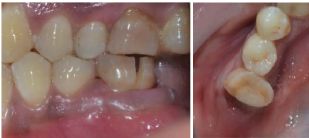
Placement of grooves