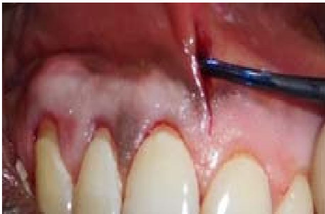
Fig 2: Case 1 Periosteal tunnel preparation