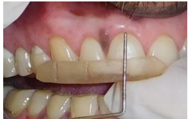
Fig 6: Case 1 Post-operative 6 month