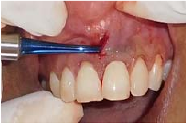
Fig 2: Case 2: Periosteal tunnel preparation