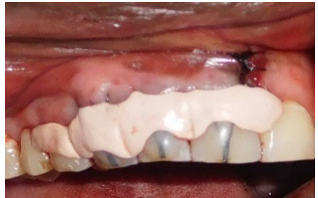
Fig 5: Case 1 periodontal dressing placed