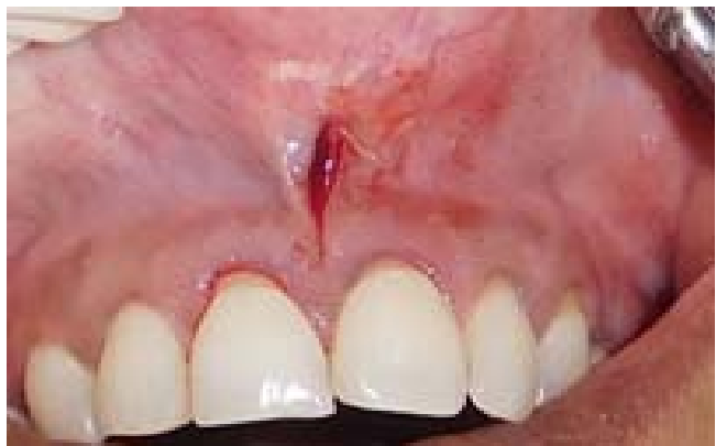
Fig 1: Case 2: Vertical incision