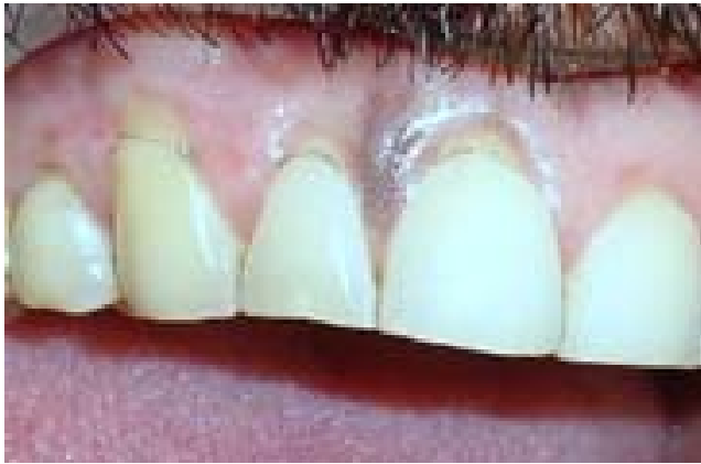
Fig 1: Case 1 preoperative view