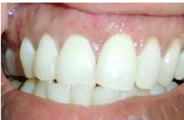
Fig 5: Case 2 Post-operative 6 month