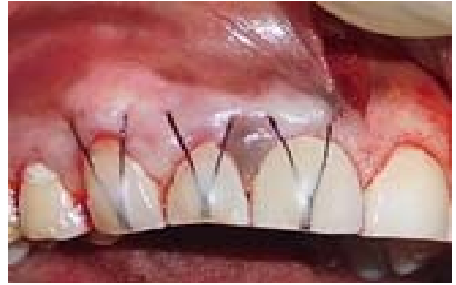
Fig 4: Case1 coronally anchored suture with composite stops