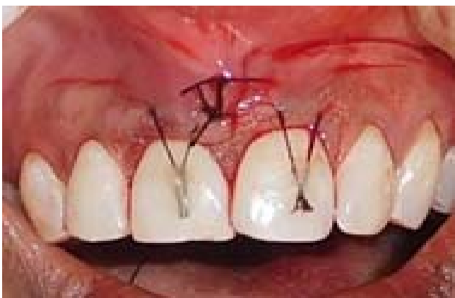
Fig 4: Case 2: Coronally anchored suture with composite stops