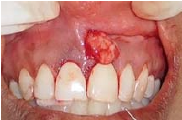
Fig 3: Case 2: Connective tissue graft inserted