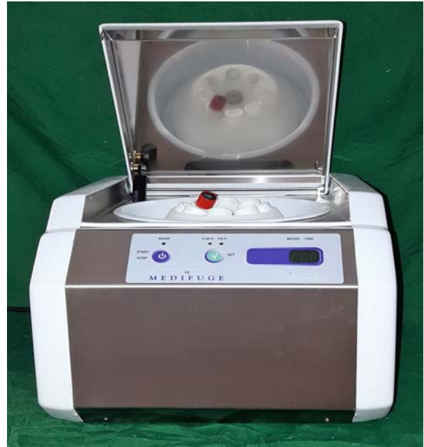
Fig 1: Medifuge, Silfradent, Sofia, Italy