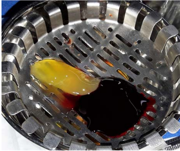
Fig 3: CGF separated from platelet-poor plasma.