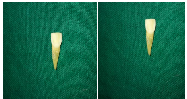
Fig 5: Group 1 and 2 showing veneer preparation