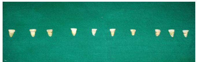
Fig 4: Veneer Preparation