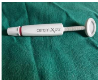
Fig 1: Ceram spheretec

Tetric n ceram is a light curing, radiopaque composite which can be used for direct veneering. It has key specifications such as versatile application, best esthetic results, bulk fill possible and special filler technology (fig 2).