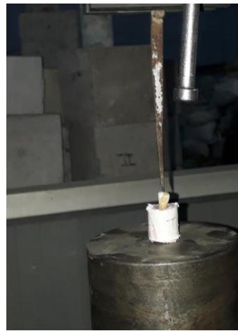
Fig 8: Load applied over the prepared tooth