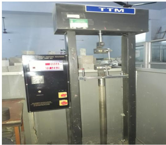
Fig 7: Universal testing machine