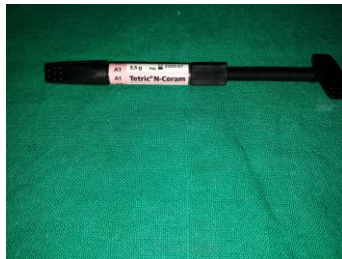
Fig2: Tetric n ceram