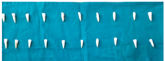
Fig 3: 20 samples

The results of this study were analyzed with one-way ANOVA and LSD test.