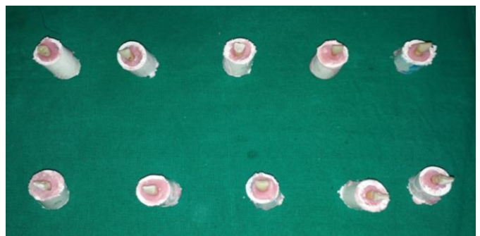
Fig 6: samples mounted on acrylic block