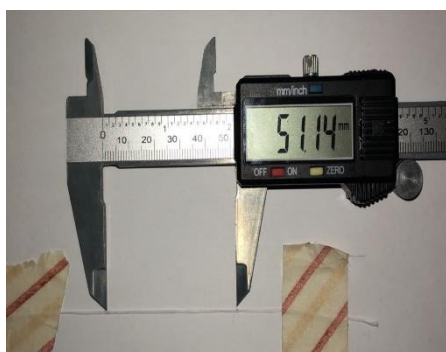
Fig 3: The distance between the marks was measured using digital caliper.