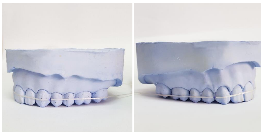
Fig 2: Markings made on the dental cast on the distal end of each canines at the greatest curvature.