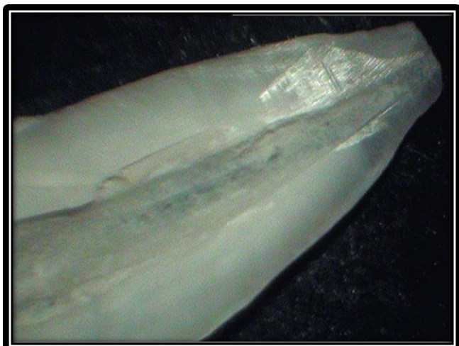
Fig 2: Group 2 (Protaper D Files)