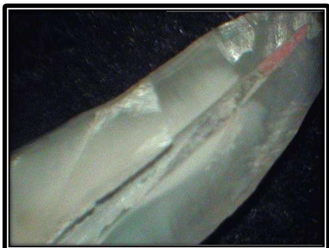
Fig 3: Group 3 (R Endo Files)