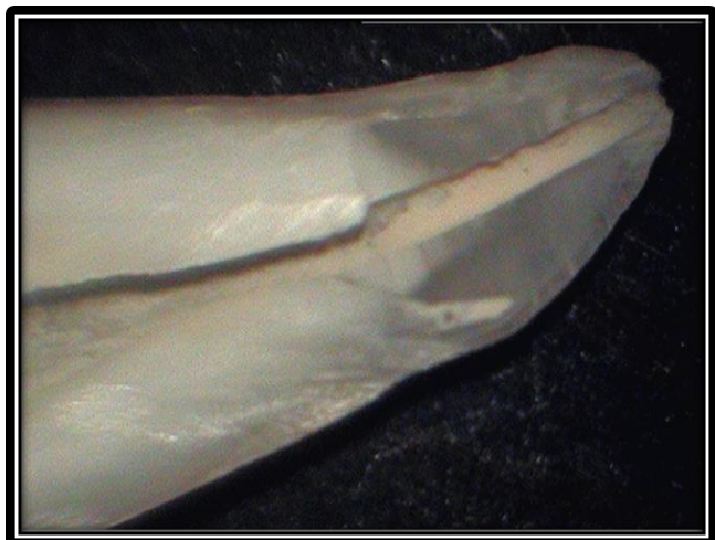
Fig 1: Group 1 (M Two R Files)

Reinstrumentation of the canals with ProTaper D files, Mtwo retreatment files and R-Endo retreatment files in respective groups was performed using X-smart endodontic motor. After the Guttapercha removal, all the teeth were sectioned longitudinally and scanned under stereo microscope (Figure 1-3).